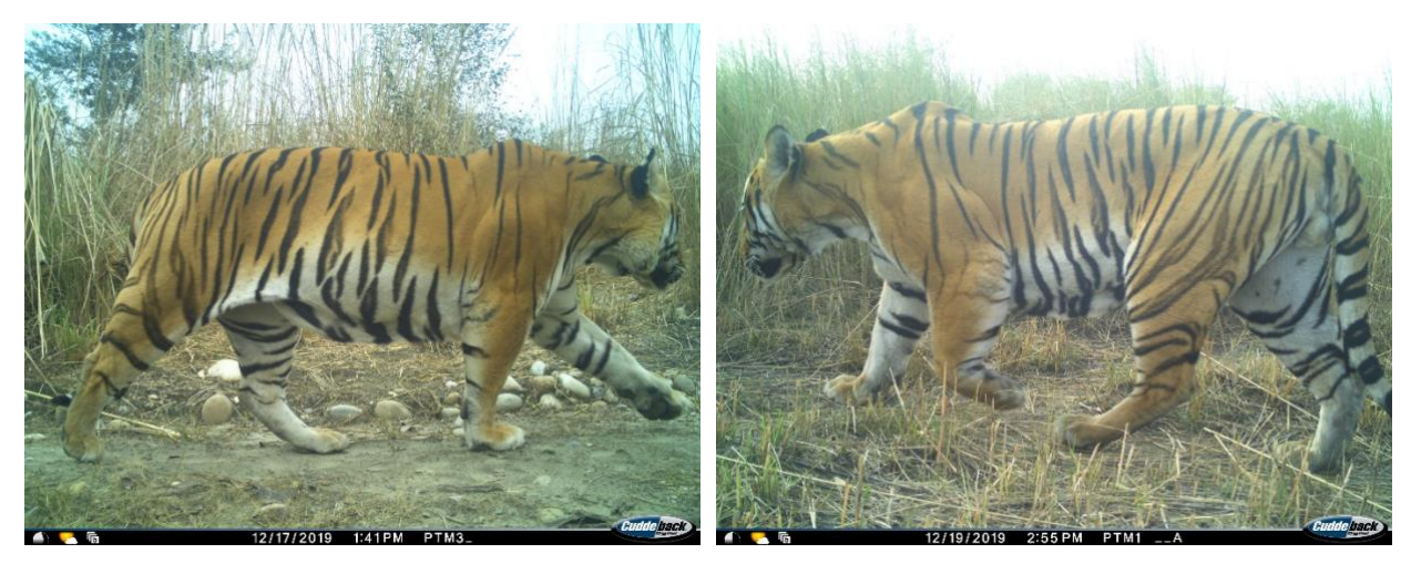
Fig. 2A. Case 2.1: Male tiger (ID: BNP M01 Danda Gau Bhale) captured on 12/17/2019 (left side), and 12/19/2019 (right side)