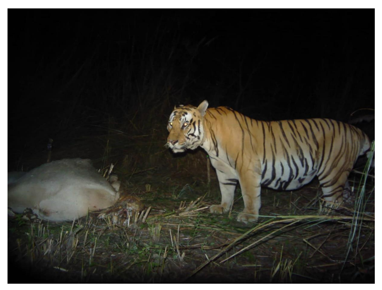
Fig. 2C. Case 2.3: Tiger captured on 11/02/2020