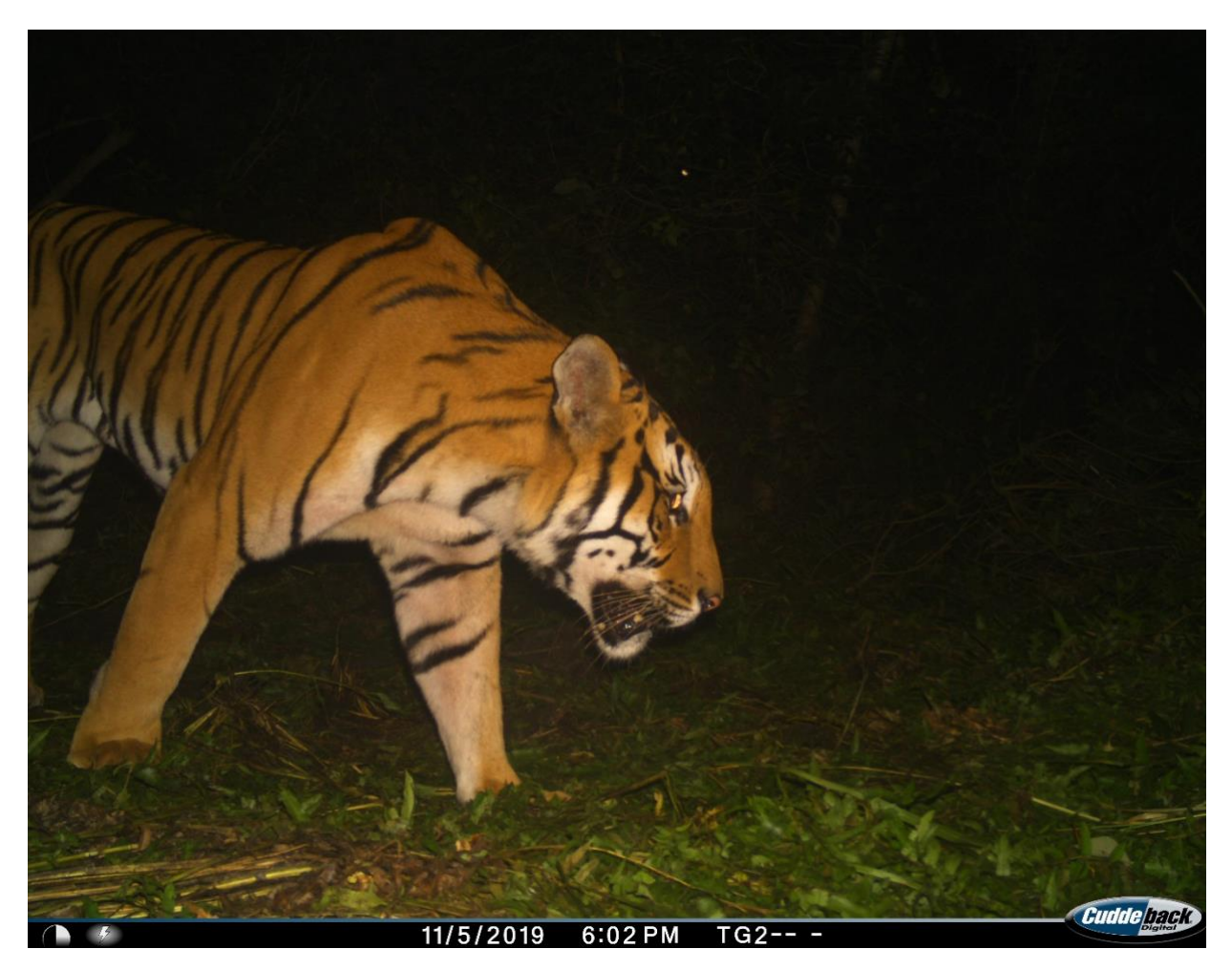
Fig. 1A. Case 1.1: Tiger attacked Elephant Staff on 2019/11/05