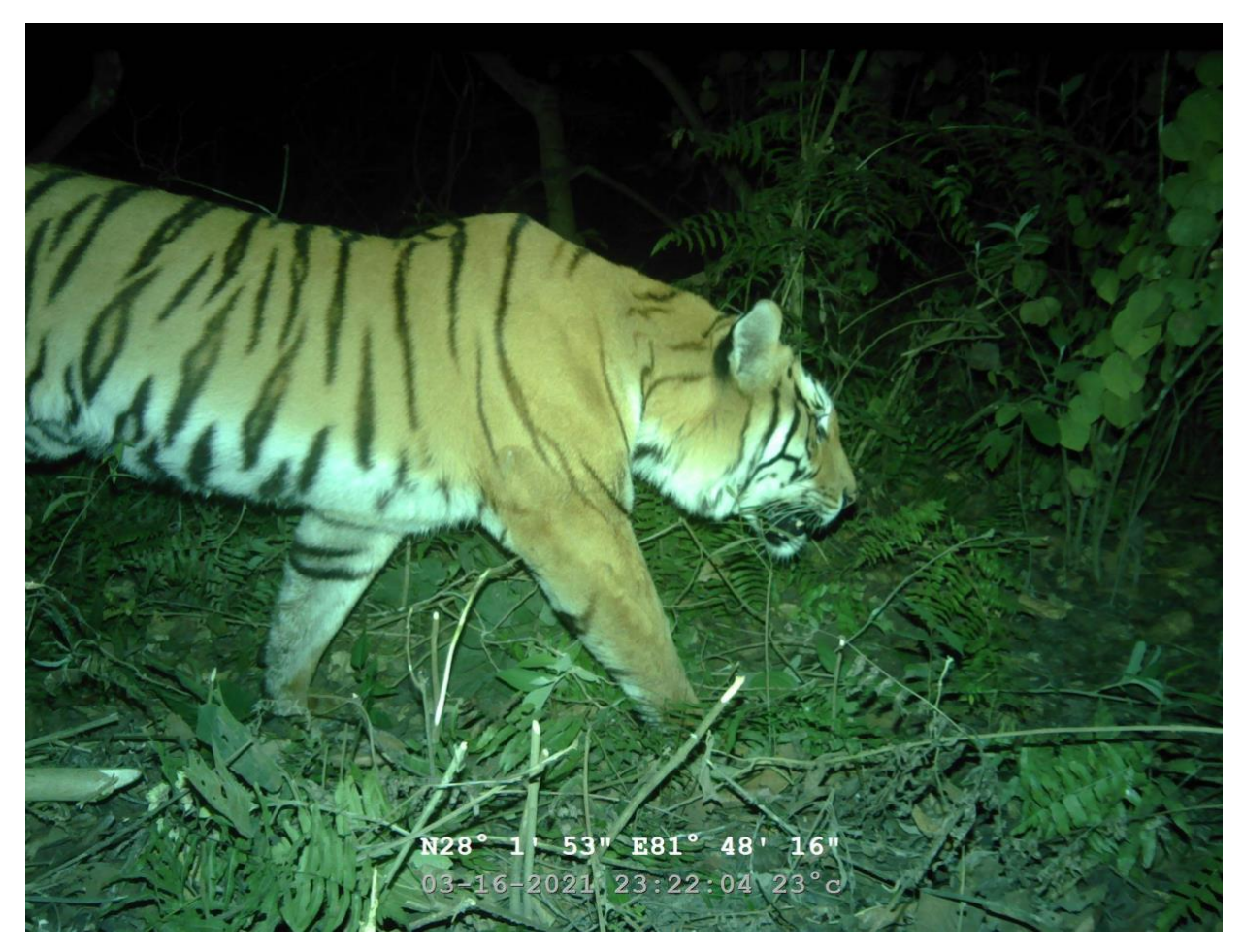
Fig. 1B. Case 1.2: Tiger attacked community woman on 2021/03/16

SOM F1 . The photographs from three conflict cases (A, B, C) revealed identical stripe patterns, leading us to conclude that the same tiger PT01 was responsible for all three incidents.