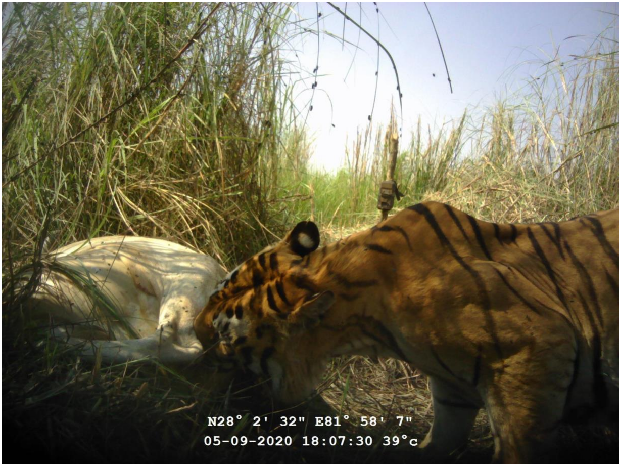
Fig. 2B. Case 2.2: Tiger captured on 05/09/2020