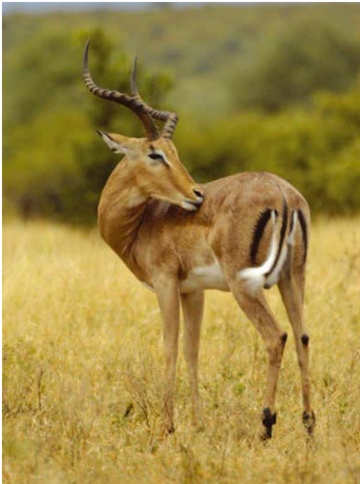
Fig. 4. Little is known about the diet of cheetahs outside conservation areas. It seems that the impala is one of the main prey species in the Thabazimbi district.