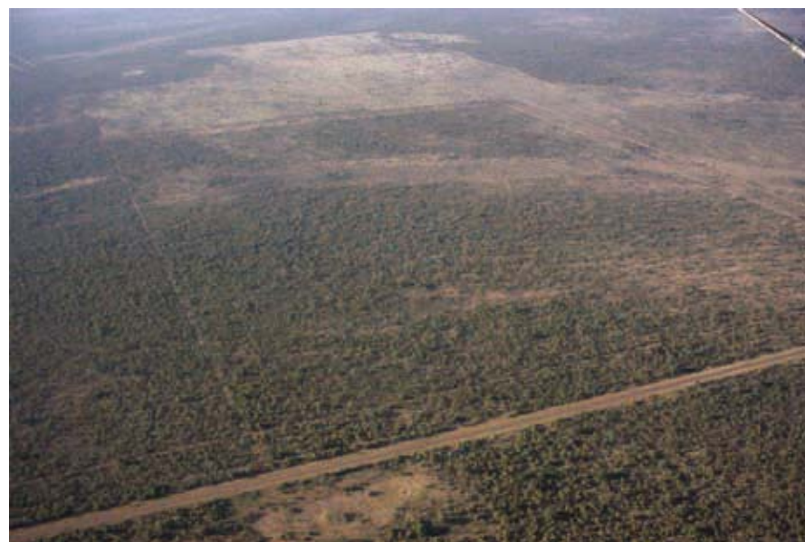
Fig. 2. The Thabazimbi district in the Limpopo province lies in the Savanna biome and the main vegetation type is mixed bushveld. The main land use is wildlife ranching.

However, most of this biome is utilised for wildlife ranching, and to a lesser extent for cattle ranching. Thus, if sustainable stocking levels are maintained on private ranches, this biome can be considered secure. This highlights the importance of the role of the private landowner in the long term conservation of the free roaming cheetah population in South Africa. It is estimated that currently over 17 million hectares of land in South Africa are used for wildlife production (Bothma 2005).