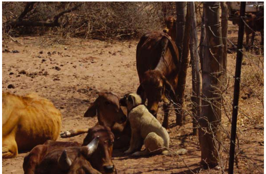
Fig. 7. Anatolian guard dogs are used to protect small livestock. Trials have now started using guard dogs to protect cattle.

Cheetahs that are received through the compensation scheme are kept in hold-