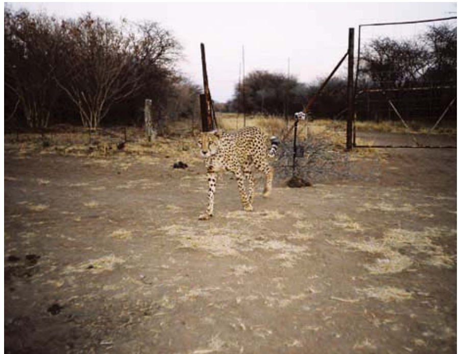
Fig. 3. Cheetah photographed using a TrailMaster camera trap on the ranch Merriepean in the Thabazimbi district of the Limpopo province. The typical game fence, gates and dense vegetation are evident.

Wildlife ranchers report high rates of predation on blesbok Damaliscus dorcas phillipsi , in the Limpopo province (De Wildt Wild Cheetah Project). Many wildlife ranches do not stock blesbok anymore as they report losing entire herds over a period of as little as two years. There is no hard evidence that cheetahs are solely responsible for this predation, and other predators and disease may also have an impact. In addition, blesbok do not occur naturally in this area and were introduced for the purpose of hunting, which may explain their poor survival. More recently ranchers are reporting losses to ostrich Struthio camelus populations.