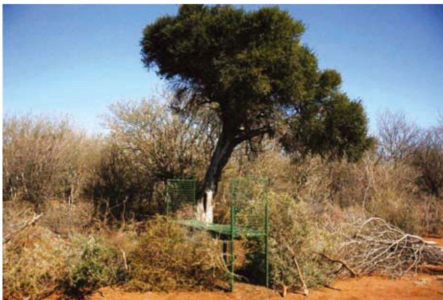
Fig. 6. Trap set to capture cheetahs. Cheetahs identified as problem animals on cattle and wildlife ranches are trapped and relocated. The landowner is compensated. (Photo K. Marnewick).

In 2000 the National Cheetah Management Programme (NCMP) was formed. This programme was initiated by a group of landowners who were concerned about the free roaming cheetah on cattle and wildlife ranches. They approached the De Wildt Cheetah and Wildlife Trust looking for solutions to the conflict in ranching areas. The landowners and De Wildt organised a meeting with conservation authorities, landowners, conservation organisations and any other party with an interest in cheetah conservation. This meeting