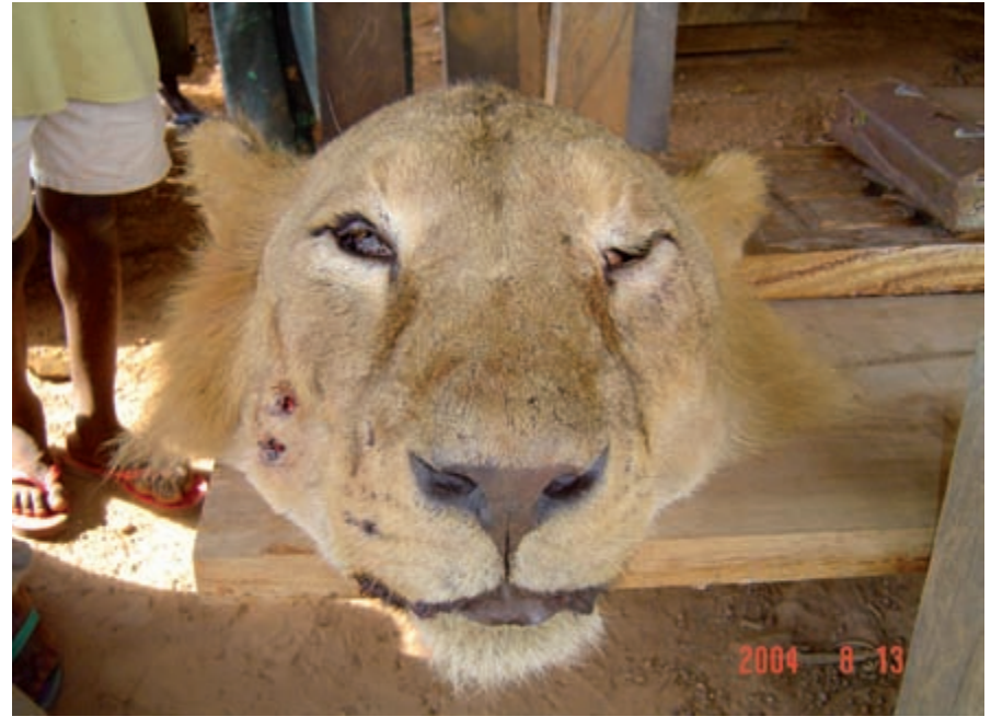
Fig. 4. Photograph of lion killed by local hunters at the edge of Mole National Park in August 2004.

We held Ghana's first national workshop on carnivore conservation during the Wildlife Division's Annual Officers Meeting in January 2009. The workshop had 45 participants, including representatives from the Wildlife Division's head office and all of Ghana's wildlife protected areas, as well as other representatives from the Forestry Commission, three local NGOs and two of Ghana's universities. A key component of the workshop was to discuss the status of lions in Ghana, and participants were asked to report recent