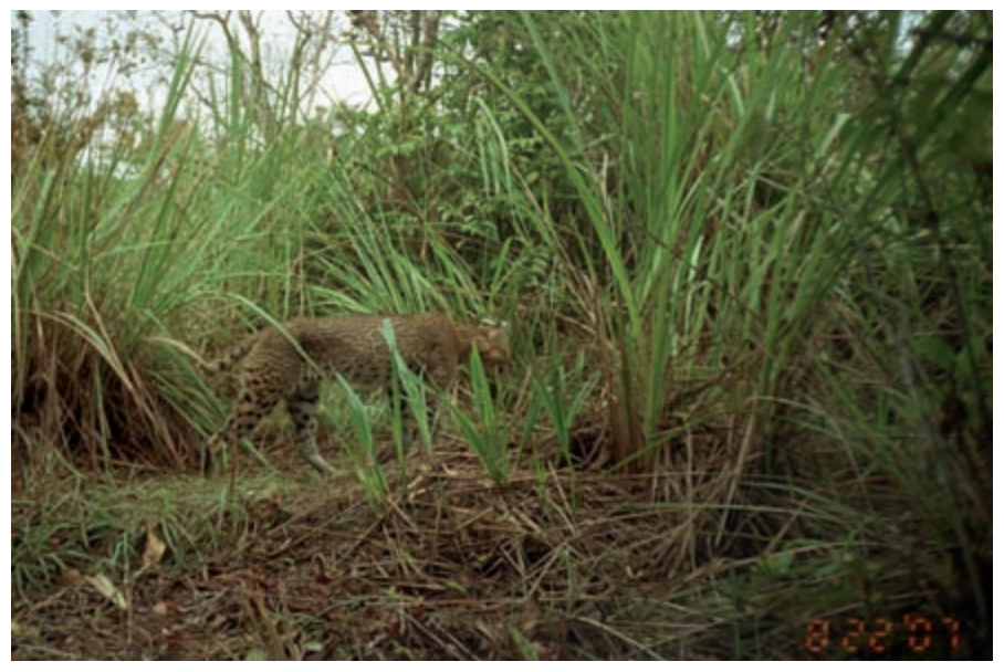
Fig. 2. Camera trap photograph of the servaline morph of the serval, Odzala NP, August 2007 (Photo P. Henschel, Panthera).

Despite persistent rumors about the continued presence of lions in Odzala and in the Batéké Plateau in southern Congo and