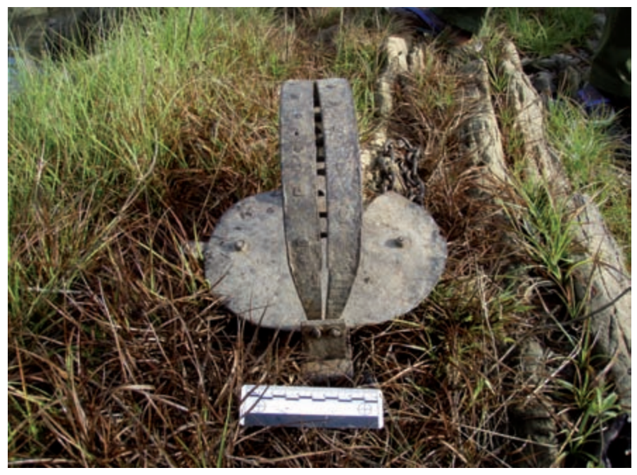
Fig. 3. Large steel gin trap found in a poacher camp in Comoé NP, northern Côte d'Ivoire, April 2010. Scale measures 10 cm.

senting 12 individuals, nobody had heard or seen lions in recent years; the last observation from these reports dated to 2004.