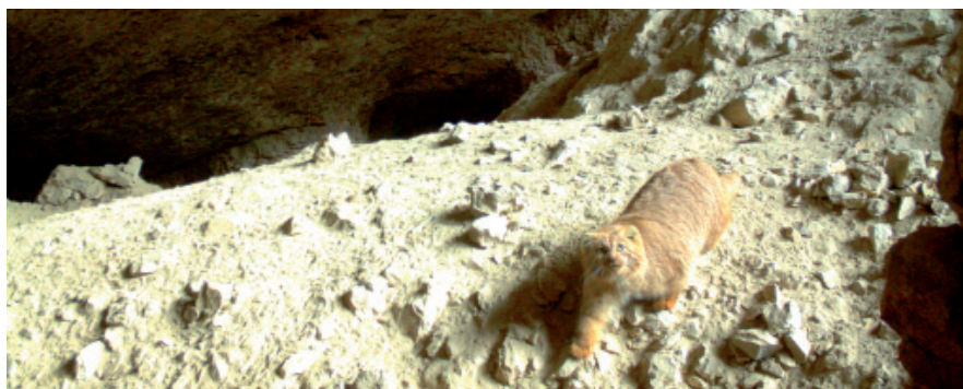
Fig. 4. A camera trap photograph of a Pallas's cat in Bamyan Plateau, Bamyan Province, Afghanistan, 20 December 2015. The camera trap was deployed for a Persian leopard detection survey.