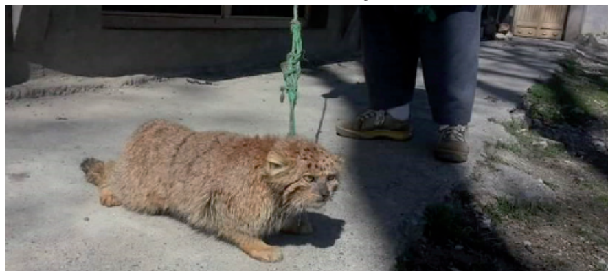
Fig. 3. Pallas's cat kept as an exotic pet from Parachinar Valley, Khyber Pakhtunkhwa Province, Pakistan, March 2017. Incidental killing and live trapping threaten Pallas's cats in the study region.