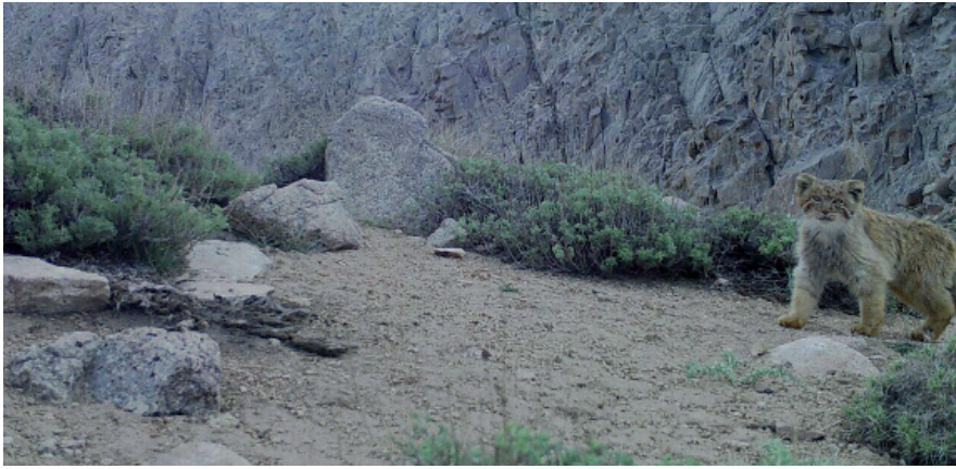
Fig. 2. A camera trap picture of a Pallas's cat in Shirkuh No-Hunting Area, Yazd Province in Iran, 19 May 2017.

large scale in the study region. Incidental killing by pastoralists or their herding dogs, anthropogenic and climate change-induced habitat loss and habitat fragmentation and, possibly, depletion of preferred prey (i.e. pikas) could threaten to an unknown extent the Pallas's cat populations in the study region. Although there is no management or conservation plans specific to the Pallas's cat in this region, the species is officially protected in all range countries.