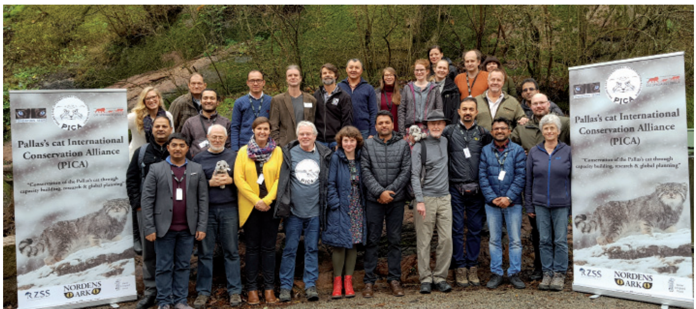
Fig. 1. Participants of the Pallas's cat Global Action Planning Meeting, Nordens Ark November 2018.

A prerequisite for good conservation is continuous monitoring and robust assessment of the population. This Special Issue will also set the baseline for future work and assessments of the Pallas's cat, and it marks the beginning of a range-wide cooperation of Pallas's cat experts. It is the first part of a process leading to a comprehensive and range-wide approach to Pallas's cat conservation based on the IUCN standards for strategic planning for species conservation. Strategic planning for species conservation according to IUCN SSC should be participatory, transparent and informed by the best available science. A transparent and participatory planning process helps to build partnerships, secure buy-in from stakeholders and local people, prevents loss of time and inefficient use of funding. The first step in the Strategic Planning Cycle (Fig. 2) is “preparing the ground”: defining the conservation unit, building the partnerships, identifying