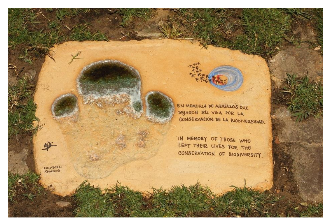
Plaque at Marismillas Palace in memory of those who gave their lives for the conservation of biodiversity