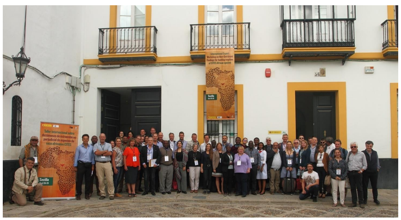
Participants attending the workshop

https://www.dropbox.com/sh/ojve8xwz53sl7ik/AADGpt80_E1hhBENOwV2K7DGa?dl=0