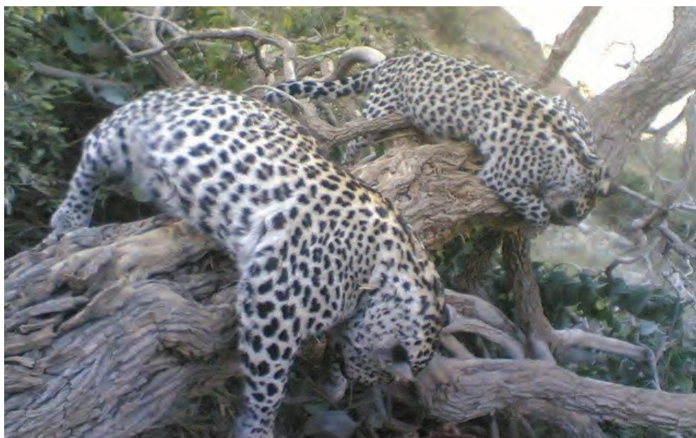
Arabian leopard poisoned in an Namas/Al Nams in the Kingdom of Saudi Arabia in spring 2007

The most obvious problem facing the Arabian leopard is the alarming reduction in its distribution area (Fig. 1), resulting in a strongly fragmented population with an unknown, but without any doubt dangerously reduced number of animals left in the wild (Spalton and Al Hikmani 2006). The lack of reliable data for most of the possible or probable distribution areas (Fig. 1) and the limited scientific work done in the past makes the analysis of threats an uncertain exercise. The workshop participants have analysed the reasons for the decline of the population (Causes), the now active Threats to the survival of the leopard, the knowledge or capacities lacking for its conservation (Gaps), and the factors hindering the implementation of conservation measures (Constraints). As a consequence of the notorious shortage of data and knowledge, the list of Gaps and Constraints is considerably longer than the list of Causes and Threats.