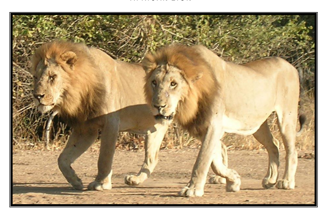
Zambia Wildlife Authority Ministry of Tourism, Environment and Natural Resources