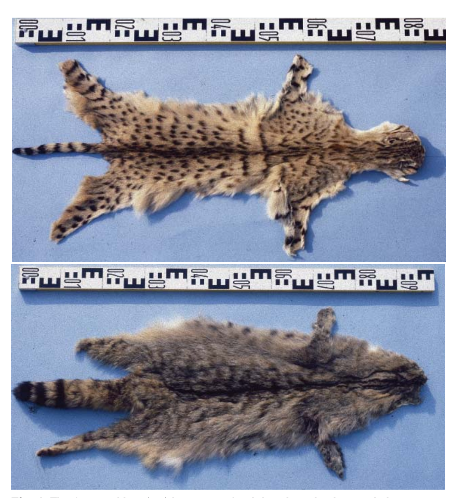
Fig. 1. The Asian wildcat (top) has a more brightly coloured pelage and clearer spots compared to the European wildcat (bottom), where faint spots often coalesce to a striped pattern and the fur is darker.

Wildcats of Central Asia Felis silvestris ornata have a light fur, ranging from greyish to sandyyellow to reddish. They differ from other wildcat subspecies mainly in their distinct small black or red-brown spots (Fig. 1). The spots sometimes form transverse stripes or bars, especially on the legs and tail (Sunguist & Sunguist 2002). Such striped cats are most often found in the Central Asian regions east of the Tian Shan. The Asian wildcat has a long, tapering tail, always with a short black tip, and with spots at the base. The forehead has a pattern of four well-developed black bands. A small but pronounced tuft of hair up to one cm long grows from the tip of each ear. Paler forms of Asian wildcat live in drier areas and the darker, more heavily spotted and striped forms occur in more humid and wooded areas. The throat and ventral surfaces are whitish to light grey to cream, often with distinct white patches on the throat, chest and belly. Throughout its range