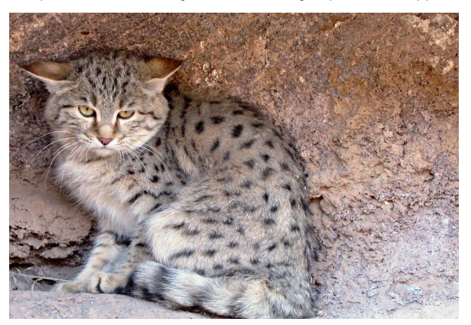
Fig. 1. An Asiatic wildcat from Naeen, Isfahan Province.

biologists, DoE officers, rangers, camera trapping projects, wildlife photographers, zoos and museums for identification of subspecies existing in Iran by comparison of coat patterns. Also, images of wildcat from neighbouring countries (Armenia, Azerbaijan, Iraq and Turkey) were gathered. The images were then cross checked with a number of researchers specialized in wildcat biology and coat patterns (U. Breitenmoser, A. Kitchener & N. Yamaguchi pers. comm.). Only photos