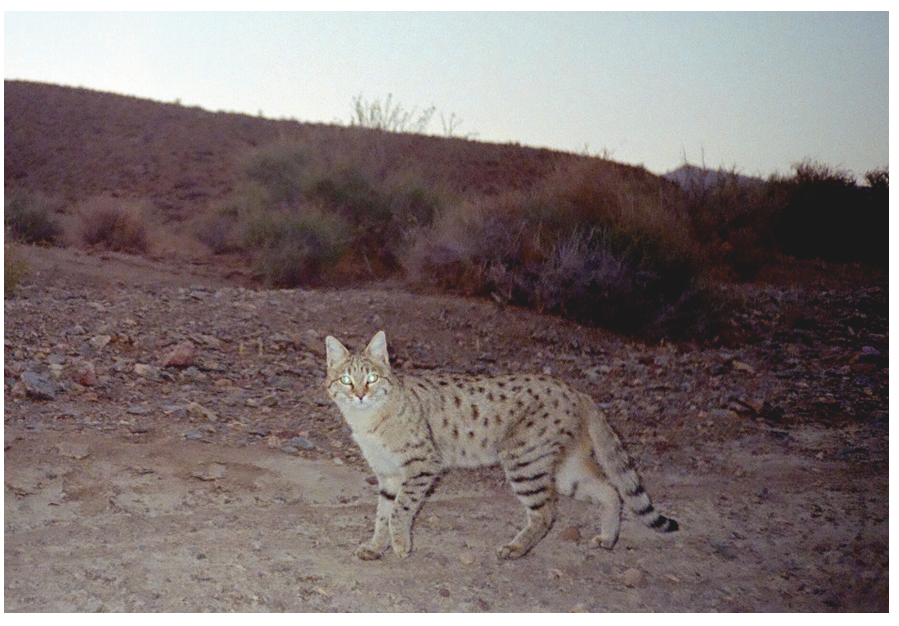
Fig. 2. A camera trap photo of an Asiatic wildcat in steppes of Touran Biosphere Reserve.

The diet of the wildcat hasn't been studied in Iran and because of wide variety of habitats for wildcat a high plasticity in prey choice of this species is expected. From