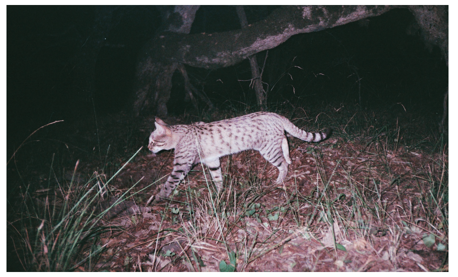
Fig. 3. A camera trap photo of an Asiatic wildcat in the Hyrcanian forest of Golestan National Park.

studies of wildcats in other parts of its range, rodents are considered as the preferred prey: members of Dipodidae (jerboas) and Muridae families (gerbils Gerbillinae, voles Arvicolinae, and mice Murinae; Heptner & Sludskii 1992) making up to 81% of its diet (Novikov 1962). The diet also includes hares, young ungulates, birds, insects, lizards and snakes (Heptner & Sludskii 1992). During the years with decline in rodent numbers, diet constitutes of insects, reptiles and even vegetables. They are frequently reported to raid poultry farms in different parts of Iran (Etemad 1985).