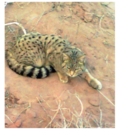
Fig. 5. A wildcat captured in a Houbara bustard trap in Southern Khorasan Province.

Yamaguchi, N., Kitchener, A., Driscoll, C. & Nussberger, B. 2015. Felis silvestris . The IUCN Red List of Threatened Spe-