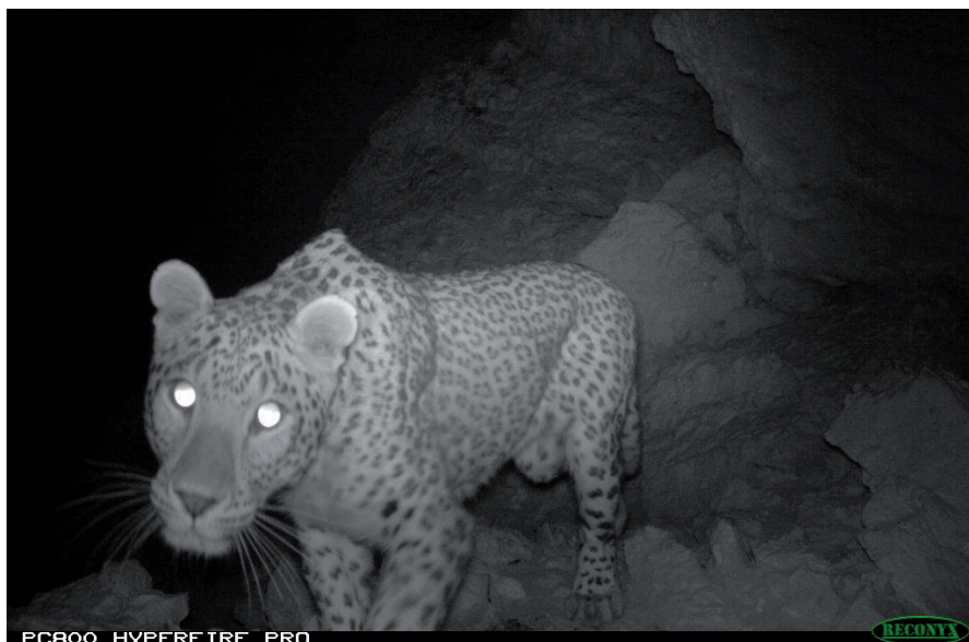
Fig. 2. Common leopard pictured in the province of Bamyan on 16 September 2011.

level of protection in the country. Hunting or harvesting this species is strictly prohibited.