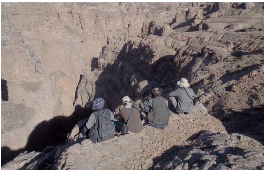
Fig. 3. Field team searching for signs of wildlife in the province of Bamyan (Photo WCS).

Depending on the security situation in this northern plateau of Yakowlang district in Bamyan Province, and the availability of funding, the Wildlife Conservation Society is hoping to carry out more extensive surveys (Fig. 3) to get a more accurate assessment of the status of the Persian leopard in these central highlands of Afghanistan.