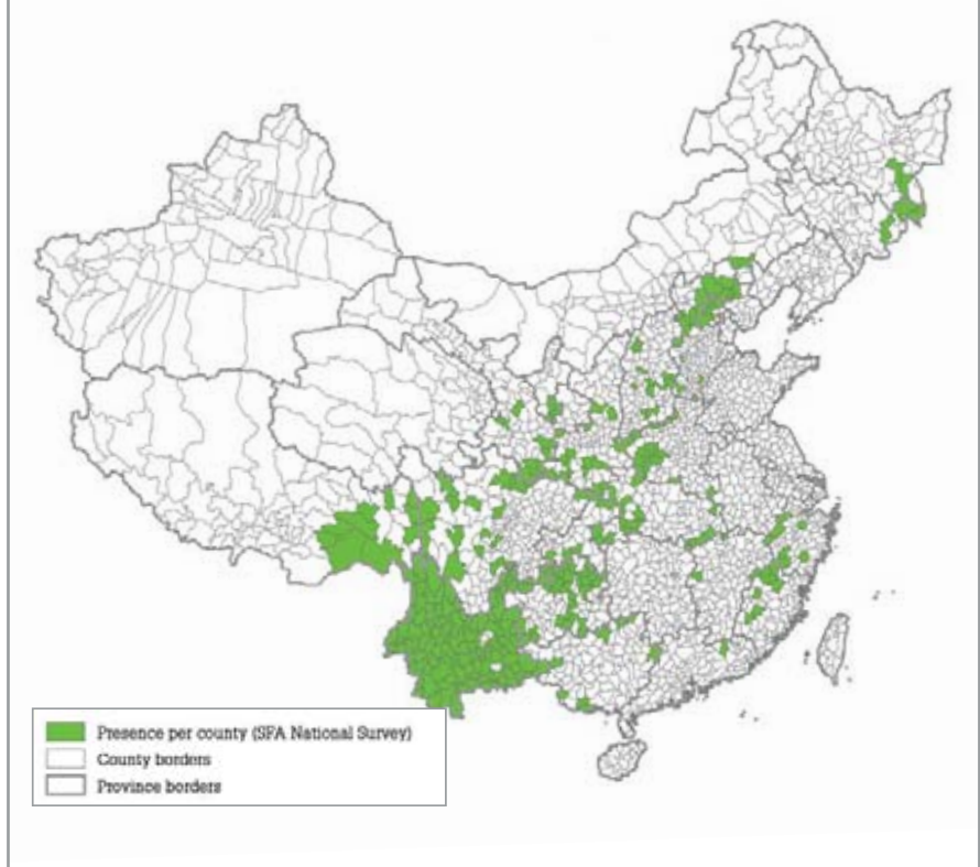
Fig. 2. Distribution of the leopard in China.