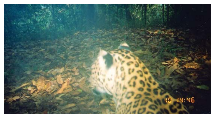
Fig. 3. Camera trap picture of an Indo-Chinese leopard taken in October 2008 in the Xishuangbanna National Nature Reserve in Yunnan, China.

The survival of the leopard in central and south China depends on the efficient protection of the species in reserves (e.g. Jackson 1991, Johnson et al. 1993, Lu et al. 2010). These reserves – if poaching of predators and their prey is successfully suppressed - can host source leopard populations and hence build strongholds for the conservation of the species. Protected areas can however not prevent fragmentation and isolation of these inevitably small populations. The county survey map already reveals a high degree of fragmentation (Fig. 2). To ensure the survival of a viable leopard metapopulation in the long term, the connectivity of these populations must be secured through maintaining corridors across the cultivated landscape. Leopards have the capacity to live in multiuse, human dominated landscapes and even at the edge of settlements, but these areas with presumably high anthropogenic mortalities will inevitably be sink populations, which need to be fed through immigration from well-protected source populations. The first step towards improved conservation of leopards in central and south China is to improve the protection and establish efficient monitoring programmes in a number of important protected areas in the range of P. p. japonensis and P. p. delacouri. Sound monitoring will improve our understanding of the status and trends of the local populations.