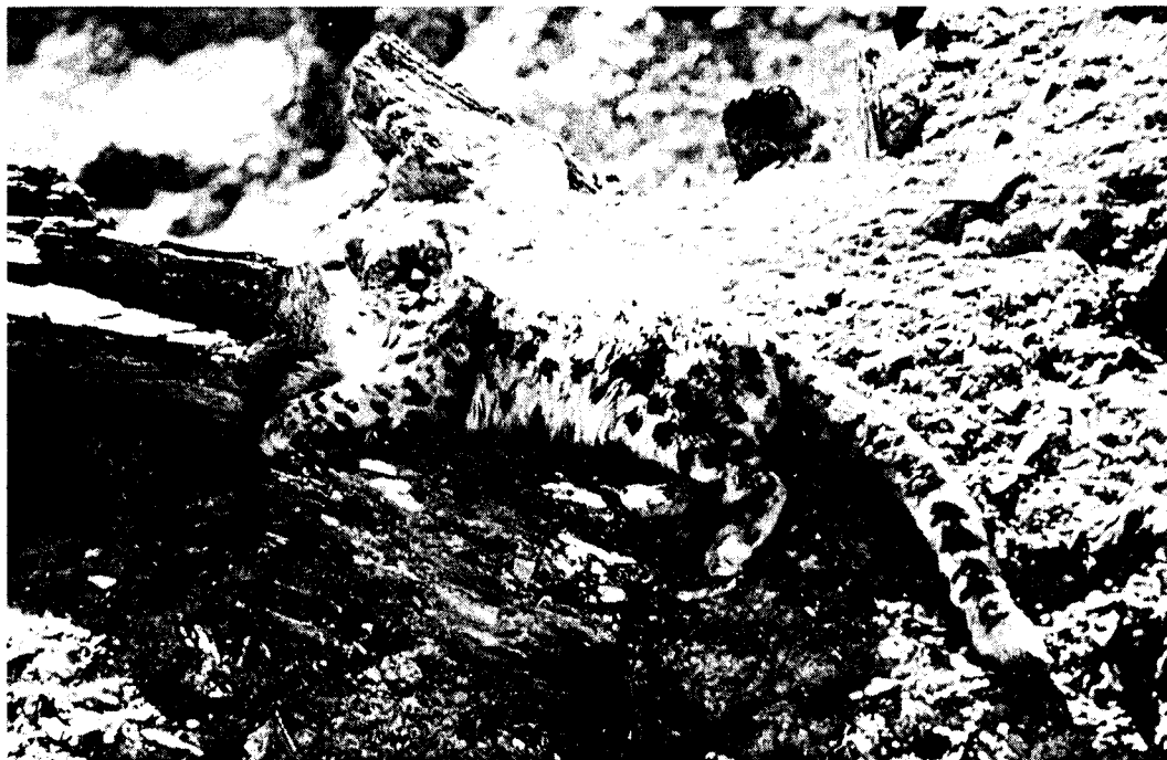
Fig. 2. A snow leopard seen during the surveys in March at about 4000 m on cliffs above the Markha valley in central Ladakh.

least on the south side of the Himalaya. Snow leopard tracks in winter also showed a similar trend toward lower frequency from central to southern Ladakh ( p < 0.05 ), but there was no difference in track frequency between southern Ladakh and the spring surveys on the south side of the Himalaya. Scrape frequency in the summer surveys was also greater ( p < 0.01 ) in central than in southern Ladakh. During summer few tracks were found and no difference in track frequency was detected between central and southern Ladakh. This demonstrates either that snow leopards make little use of major valley bottoms at this time of year, or simply the difficulty in observing their tracks without snow cover. Nevertheless, with the scrape data we have a clear indication of important differences in sign frequency among the major survey zones.