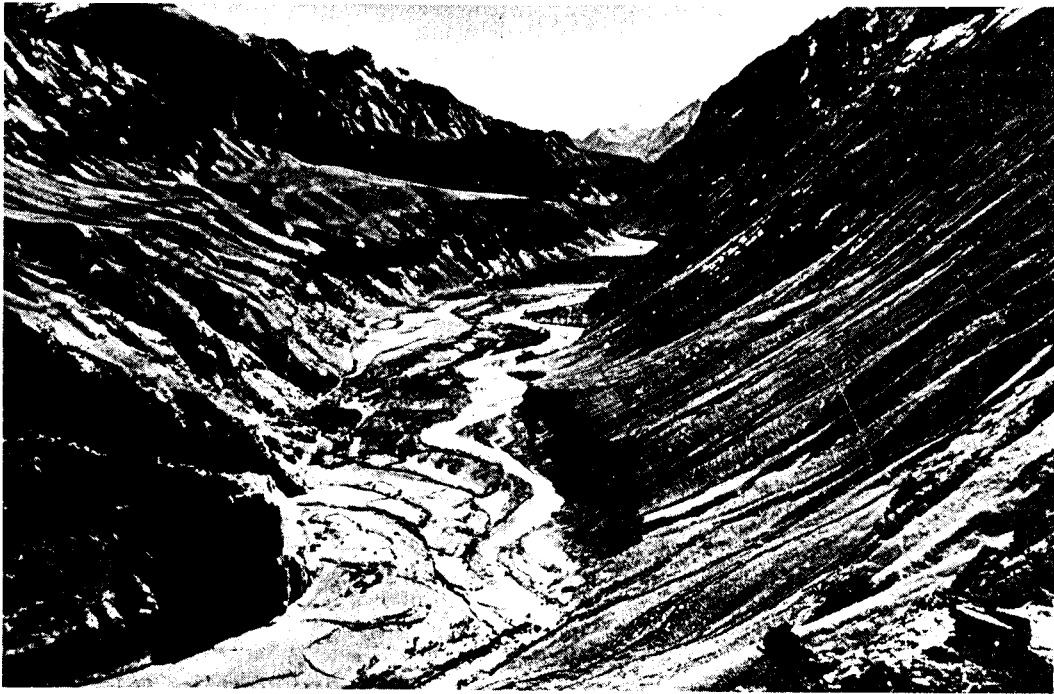
Fig. 3. Typical snow leopard and blue sheep habitat in the Markha valley, as seen from the resting spot of the snow leopard in Fig. 2. Note the cultivated fields and shrub vegetation restricted to the valley floor.

average elevations, in steep-sided valleys with many cliffs, and especially along valley bottoms bounded by cliffs. Narrow valleys were much more likely to have sign and, as described above, tracks were positively, and scrapes negatively, associated with presence of snow. It is apparent here, as in west Nepal (Jackson & Ahlborn, 1988), that abundant snow leopard sign is associated with extremely rugged terrain.