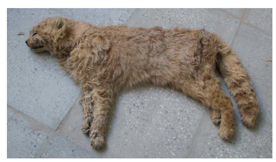
Fig. 2. Carcass of an erytristic morph of the Pallas's cat in Bafq, Yazd Province, in January 2008 (Photo Yazd DoE).

According to Rustamov & Sopyev (1994), the manul also exists in southern Turkmenistan, neighboring north-eastern Iran. Pocock (1939) also reported a specimen from east-