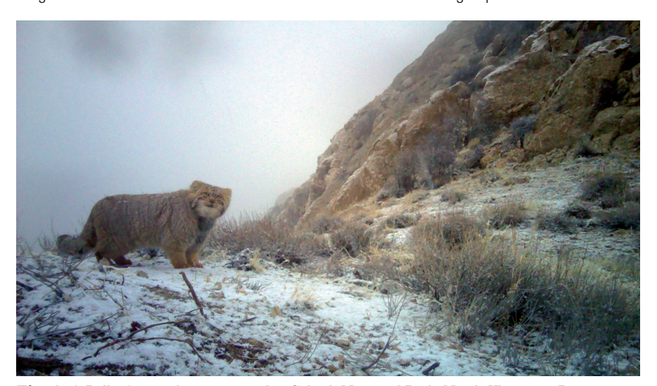
Fig. 1. A Pallas's cat photo-trapped in Salouk National Park, North Khorasan Province, in fall 2015.