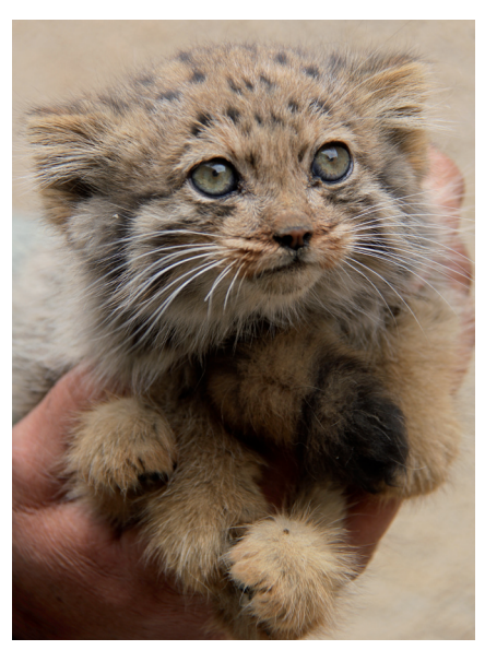
Fig. 5. A Pallas's cat cub perceived as a leopard cub and captured by a local herder in Tandoureh NP in April 2014.

Khabr NP, Yazd Province) or leopard cub (e.g. Tandoureh NP, Razavi Khorasan Province; Fig. 5). Recent conservation prioritization analysis based on evolutionary distinctiveness and globally endangered score has given the Pallas's cat a high priority for research and conservation actions in Iran, i.e. first ranking among Iran's lesser cats and one of top ten country's carnivore species (Farhadinia et al. 2016).