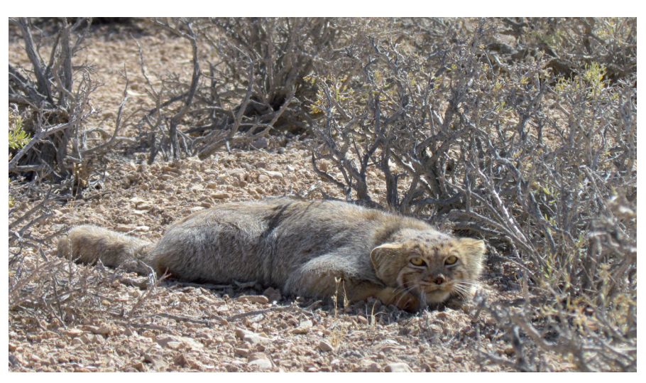
Fig. 3 A Pallas's cat in Khosh Yeilagh WR in September 2015.

The Pallas's cats feed mainly on small rodents and lagomorphs, in particular pikas of genus Ochotona . Moreover, small ground birds, hedgehogs, lizards and invertebrates are occasionally hunted. According to Heptner & Sludskii (1972), the manul's habitat is also typified by the presence of pikas and other small rodents, which constitute the bulk of its prey. The authors found remains of pikas in 89% of scats. In Mongolia, Ross et al. (2010b) recorded the manul feeding on a broad range of prey from insects to small mammals and birds. Nonetheless, diurnal pikas were highly