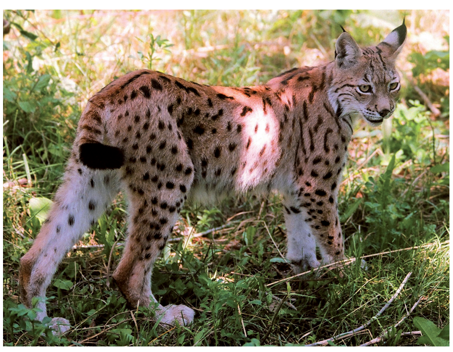
Fig. 1. A free-ranging human-habituated lynx photographed in Sarab, East Azarbayjan Province in 2003.

The Eurasian lynx is the largest member of the genus Lynx . In spite of being considered as a lesser felid, the lynx appears powerfully built with its strong and long legs. It has ears with 4-7 cm long, black hair tufts, a well-developed facial mane hanging down from its lower cheeks, and a short black-tipped tail about one-sixth of the head-body length (Nowell & Jackson 1996). The winter fur colour is variable from grey to yellowish or brown to greyish but the under parts of body are whitish (Sunquist & Sunquist 2002). Three main coat patterns for lynx are reported: predominantly