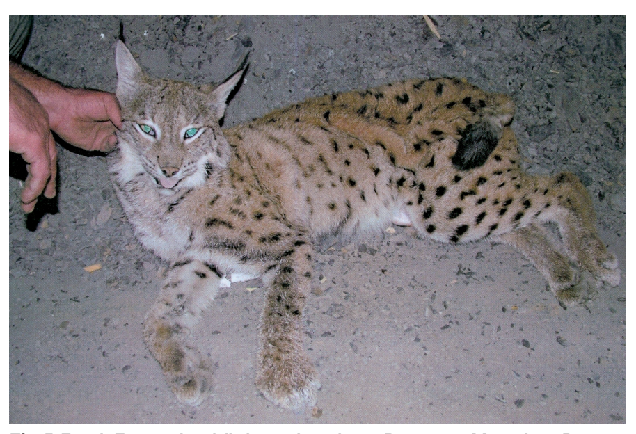
Fig. 5. Female Eurasian lynx killed in road accident in Bayjan area, Mazandaran Province, in September 2008 (Photo Mazandaran Department of Environment).

Schmidt K. 2008. Behavioral and spatial adaptation of the Eurasian lynx to a decline in prey availability. Acta Theriologica 53, 1-16.