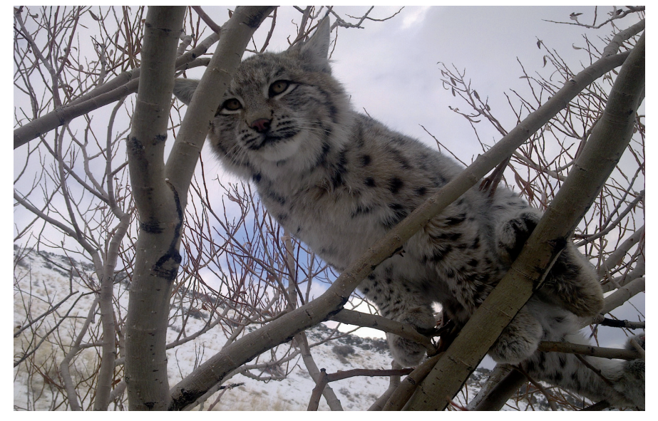
Fig. 4. A young Eurasian lynx in Avaj No-Hunting Area, Oazvin Province, in January 2012. The young animal was chased and treed by herding dogs, but later released.

ever, these landscapes are threatened due to clear-cutting and intensive logging (Sagheb-Talebi et al. 2013). Furthermore, traditional livestock husbandry system increasing risk of lynx-herding dog encounters is considered to be another threat to lynx in the country.