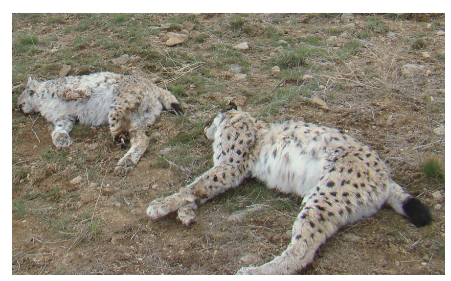
Fig. 6. Male and female Eurasian lynx found electrocuted by sagging power lines in Sayin Darreh, Abyek, Qazvin Province, in March 2016.

Sunquist M. & Sunquist F. 2002. Wild Cats of the World. The University of Chicago Press, Ltd., London. 452 pp.