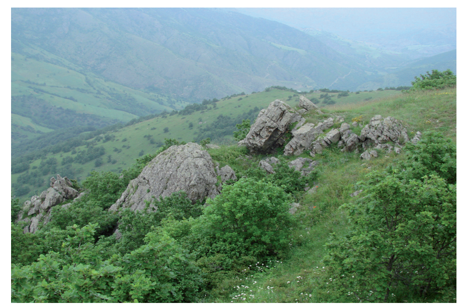
Fig. 3. Eurasian lynx habitat in Arasbaran Biosphere Reserve in East Azarbayjan Province, Caucasus Ecoregion, in June 2011.