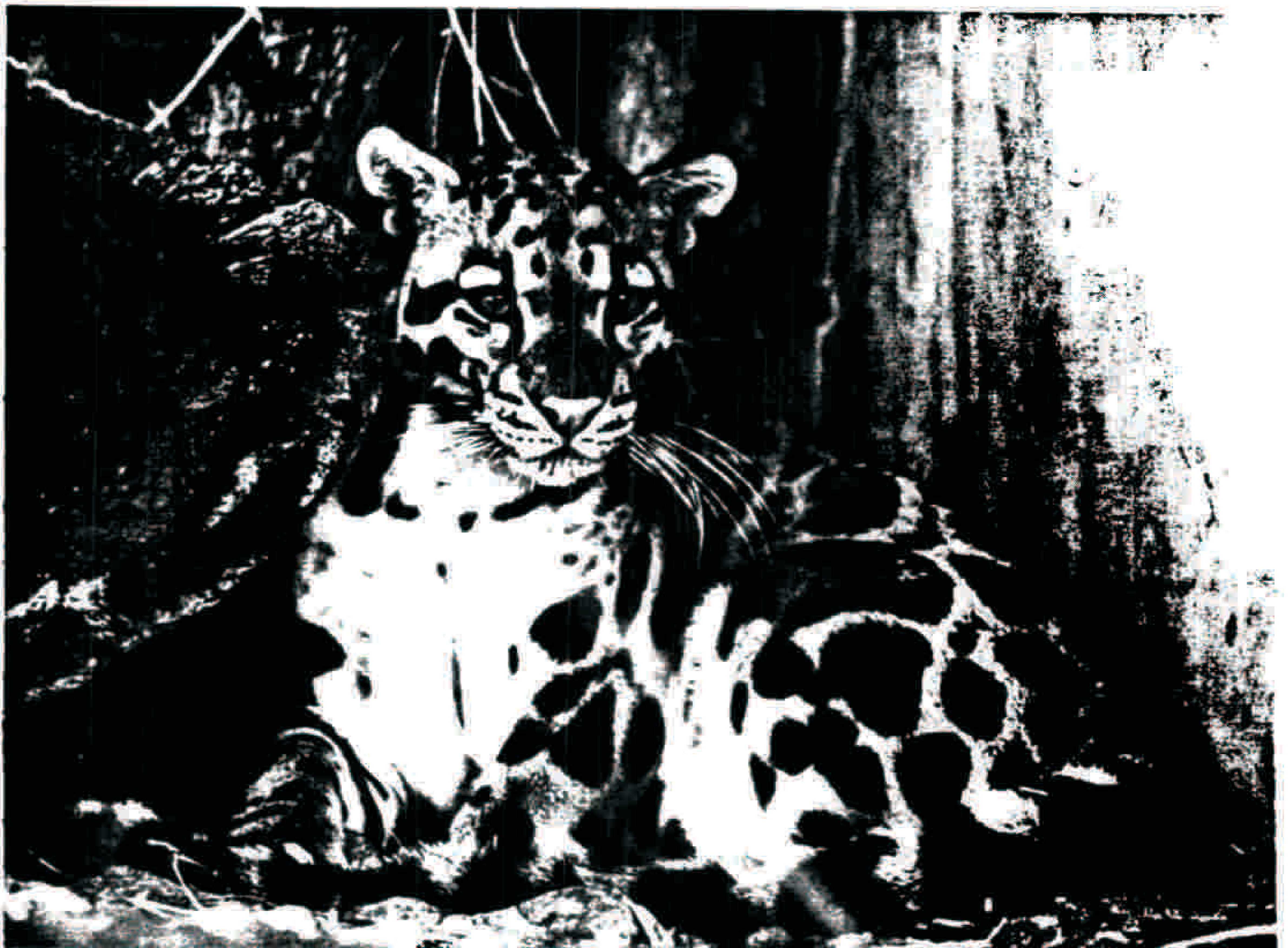
Clouded leopard in captivity in Thailand

The clouded leopard Neofelis nebulosa has already disappeared from part of its range in southern Asia; it is classified as vulnerable by IUCN and is on Appendix I of CITES. Little is known about this secretive forest-dweller anywhere in its range, and the sparse information needs to be augmented so that effective conservation measures may be taken if necessary. In early 1986 the senior author travelled through the interior of Malaysian Borneo, staying at villages and timber camps, to assess the status of the species in the region and to find out more about its behaviour.