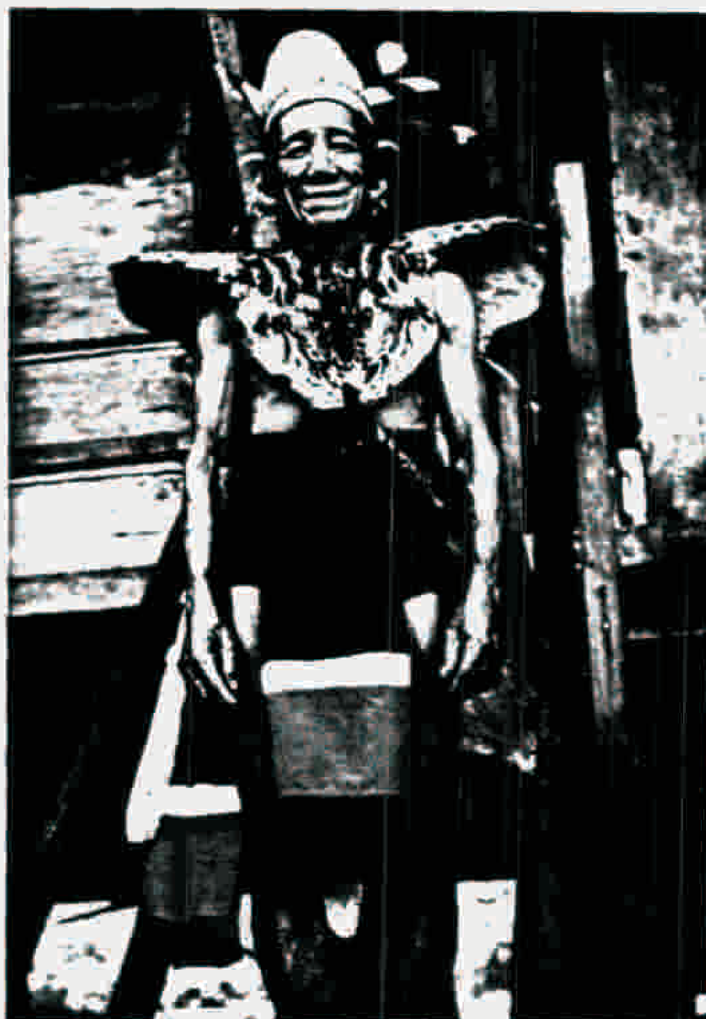
Native tribesman in Sarawak wearing a clouded leopard ceremonial coat.

Of 90 first-hand sightings or other signs of clouded leopards recorded throughout the State,