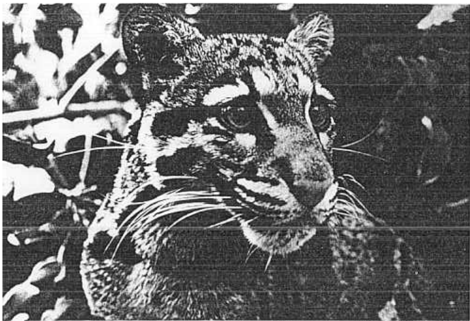
Clouded leopard (Lori Price).

individual, also a male, was stoned to death near the city of Pokhara near the Panchayat Training Centre, retrieved by forestry officials, and placed in the local museum.