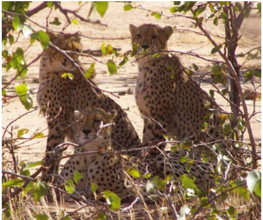
Fig. 1. Cheetahs in Matusadona National Park.

Cheetahs in Zimbabwe have been reported to hunt a range of mammals, including warthog Phacochoerus aethiopicus , grey duiker Sylvicapra grimmia , steenbok Raphicerus campestris , impala, waterbuck Kobus ellipsiprymnus , bushbuck Tragelaphus scriptus , reedbuck Redunca arundinum , zebra Equus burchelli , tsessebe Damaliscus lunatus , kudu Tragelaphus strepsiceros , sable Hippotragus niger , and buffalo Syncerus caffer (Purchase & du Toit 2000, Smithers 1966, Smithers & Wilson 1979, Wilson 1975). In Hwange and Matusadona National Parks impala make up the majority of the cheetah kills (41% and 87% respectively; Purchase & du Toit 2000, Wilson 1975). Ground