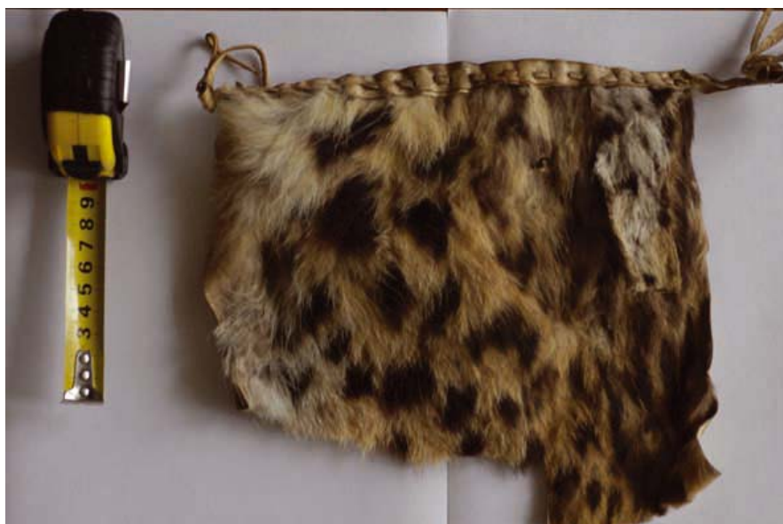
Fig. 3. Photograph of a partial skin confiscated in Zinave National Park in early 2007. It is not yet confirmed that the skin is from a cheetah.

There is still a lack of data regarding the status, distribution and threats to cheetah in Mozambique, with large areas of the country unsurveyed. The comparison between historical distribution and current suggests that there has been a significant reduction in range, and hence in population of cheetahs in Mozambique, such that their current range can be confirmed in only a single area within their historical range. This status