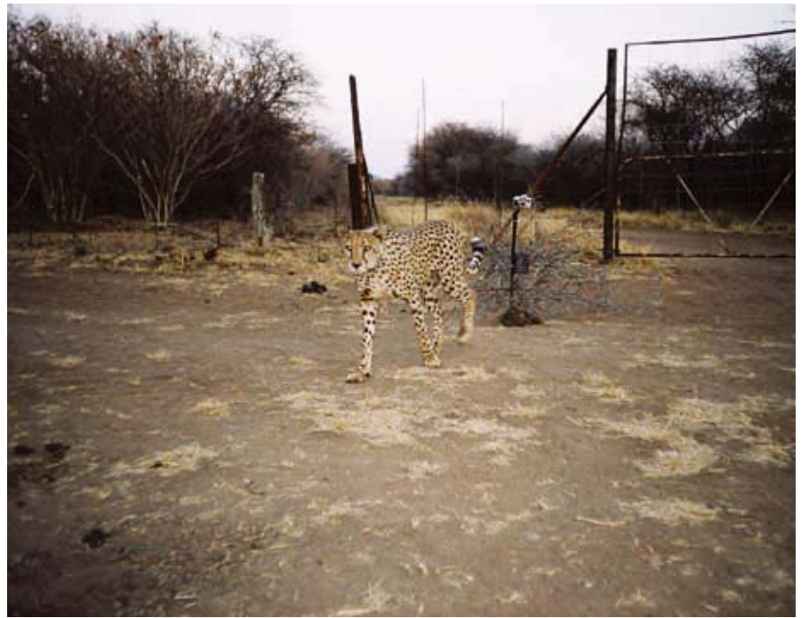
Fig. 3. Cheetah photographed using a TrailMaster camera trap on the ranch Merriepan in the Thabazimbi district of the Limpopo province. The typical game fence, gates and dense vegetation are evident.

Wildlife ranchers report high rates of predation on blesbok Damaliscus dorcas phillipsi , in the Limpopo province (De Wildt Wild Cheetah Project). Many wildlife ranches do not stock blesbok anymore as they report losing entire herds over a period of as little as two years. There is no hard evidence that cheetahs are solely responsible for this predation, and other predators and disease may also have an impact. In addition, blesbok do not occur naturally in this area and were introduced for the purpose of hunting, which may explain their poor survival. More recently ranchers are reporting losses to ostrich Struthio camelus populations.