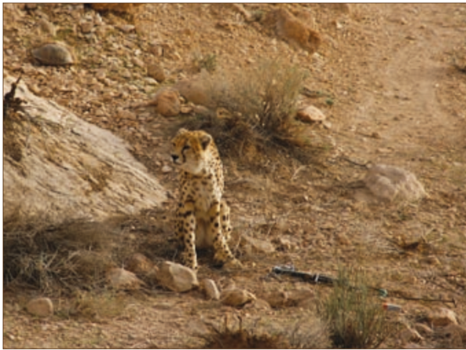
Fig. 3. Cheetahs were relatively calm in foot-snares and did not struggle violently when captured. All cats captured by foot-snares were unhurt by the process.