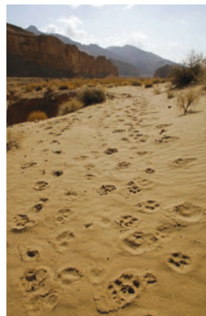
Fig 2. Game trail with cheetah tracks. Wildlife thoroughfares such as this were targeted for the setting of foot-snares.

7. To investigate the inter-relationships of Asiatic cheetahs with leopards, striped hyenas, wolves, caracals and golden jackals. By collaring individuals of each species, we aim to quantify the degree of overlap in habitat use and diet between them, and attempt to investigate the extent of competition over food resources. We will also attempt to assess whether predation of adult and juvenile cheetahs by other carnivores takes place.