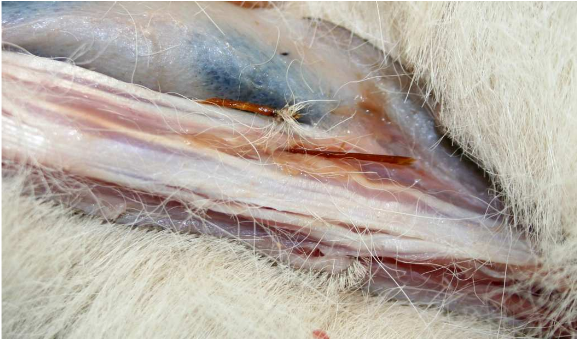
A small woody stick within its tail, laid there for long time!!!