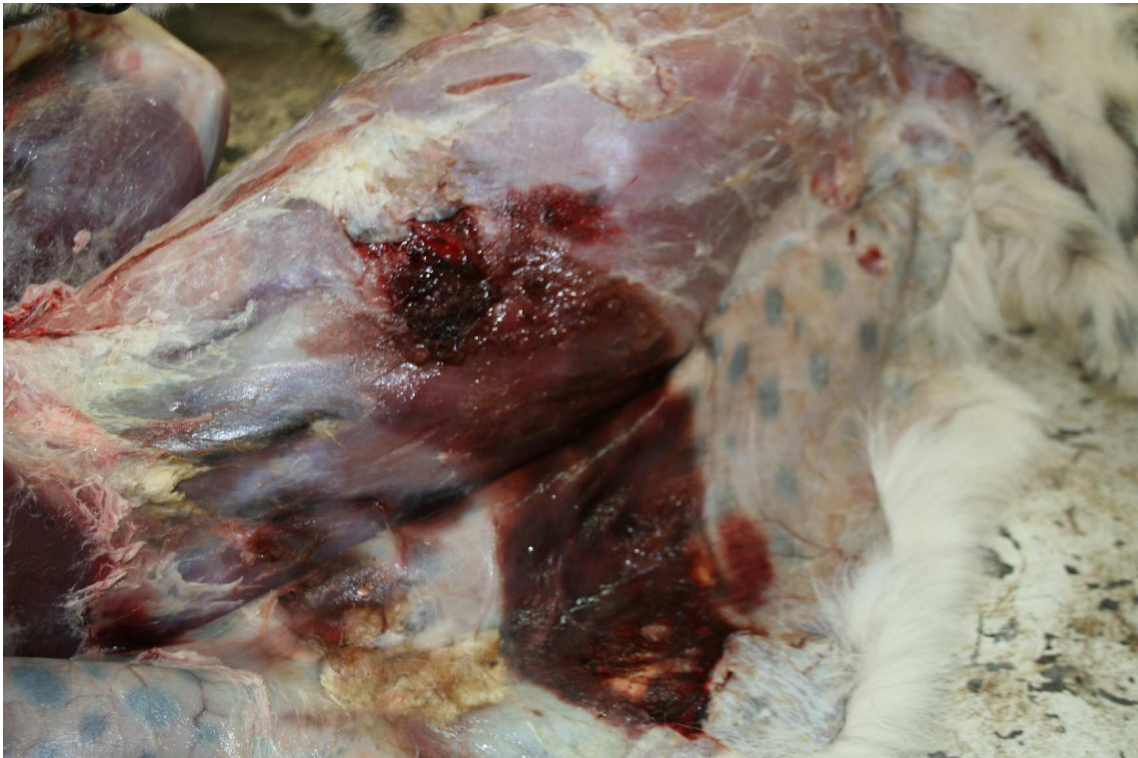
Bleeding due to incident