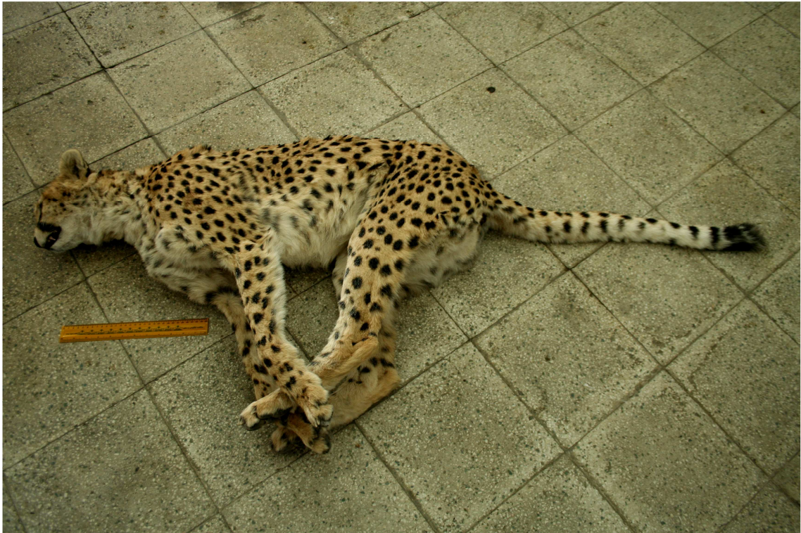
Adult female cheetah