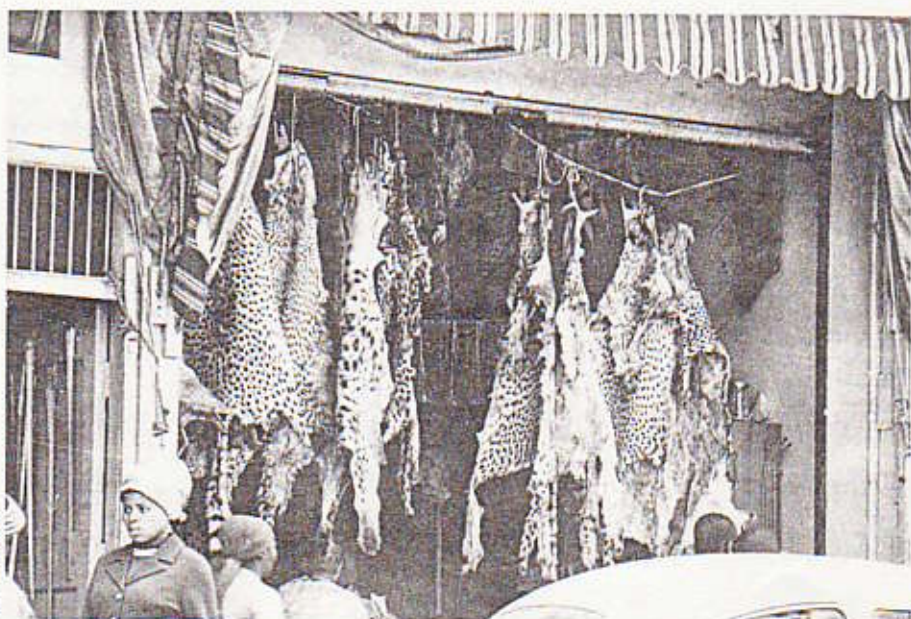
Who says the fur trade is now under control? This scene in Johannesburg speaks for itself.

In South Africa the cheetah is not endangered if it is in protected reserves, and its numbers in captivity are very healthy. Nevertheless existing laws leave loopholes which leave the animal unprotected in the wild state. Are we not tackling the wrong end of the stick in trying to classify species as "endangered" for the wrong reasons?