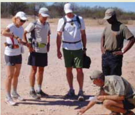
1000 km Kalahari Marathon 3 athletes at Grootlagte (starting point) being shown the route.