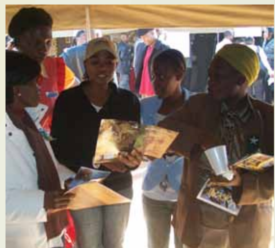
CCB staff member explaining the works of CCB at a stall in Mahalapye during the 2010 World Environment Day celebrations.