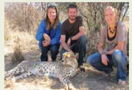
Smithsonian Conservation Biology Institute (SCBI) group from Washington DC, USA, seen here with one of Mokolodi cheetahs in 2010.

Topics that the Smithsonian could provide support for included: reducing human wildlife conflict; combating illegal trade; community based natural resource management and biodiversity monitoring. The conference took place in Gaborone on August 10-12th and was well attended by 32 participants who spent 3 days developing and prioritizing potential training programs for the country. It was extremely successful and the next step will be to decide on which of the training programs will take place in 2011. Many thanks to the Smithsonian group for choosing Botswana as the recipient for this significant support!