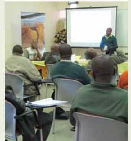
Dept of Wildlife staff member presenting at one of WKCC workshops in Kang.

CCB was engaged by Conservation International (CI) on the implementation of the WKCC initiative. The initiative aims to maintain the existing wildlife corridor between the 2 protected areas: the Central Kalahari Game Reserve (CKGR) and the Kgalagadi Transfrontier Park (KTP). 10 mobile workshops were conducted at settlements and cattle posts of the region to promote coexistence and effective management. A pilot project to test the use of mitigation methods that can reduce livestock losses has been initiated at 4 locations. 4 farmers are being assisted to improve their management techniques and assess the effect on reducing conflict. A competition for the Best Farmer in the WKCC