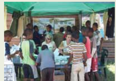
Ghanzi volunteers helping with CCB stall in Ghanzi.