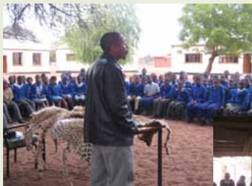
Above: One of many CCB school visits.

The focus of the workshops was to infuse predator education into lessons and curriculum. Each school received a school kit of books, activity guides, posters and DVD's. All teachers were offered encouraged to set up environmental clubs in their own schools.