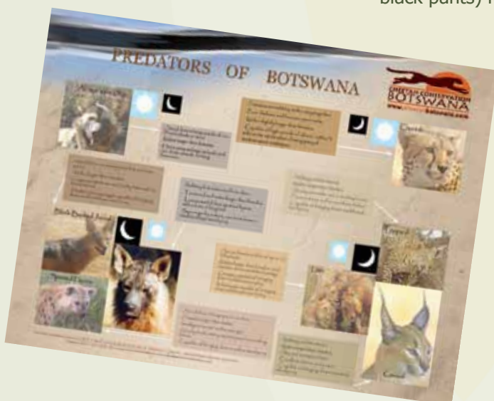
CCB 2010 Predator Education poster.