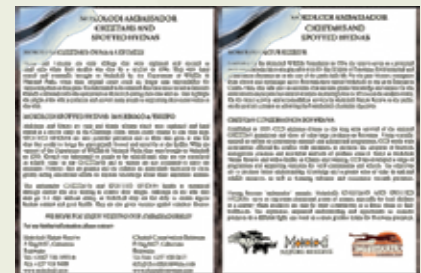
CCB/Mokolodi Cheetah/Hyena Ambassador Leaflet.