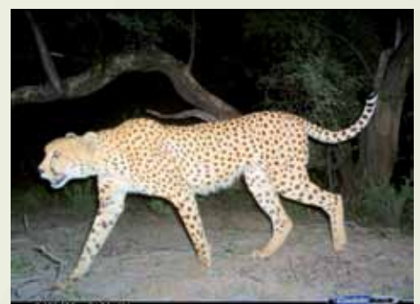
Camera trap at Ghanzi camp.