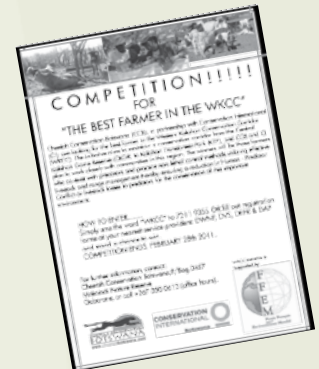
WKCC 2010 competition leaflet.