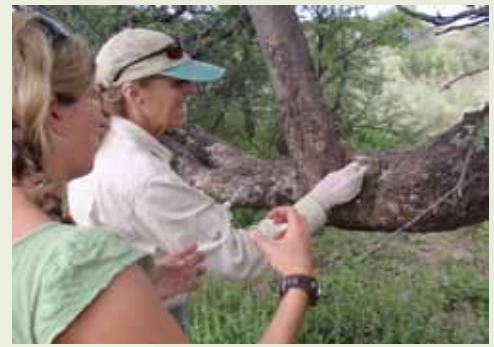
Volunteers at Ghanzi collecting scat.

CCB also provides opportunities for students to conduct postgraduate research on predator conservation. Current students include Ipeleng Randome who is conducting an MSc on cheetah genetics and Jane Horgan who is conducting an MSc on the use of livestock guarding dogs in Botswana. The results so far indicate that if trained correctly, cared for and fed properly, a dog (of any breed and lineage) can be an incredibly useful tool for managing predator-farmer conflict.