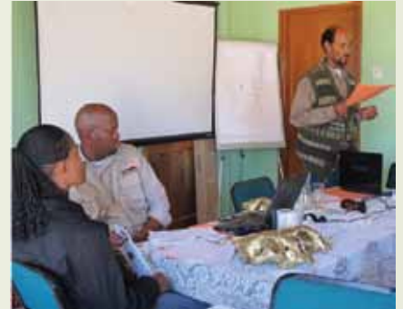
A farmer doing a presentation at one of WKCC workshops Ghanzi.

2010 saw the development of a demonstration goat farm at CCB's Ghanzi camp. A fully functional demo area with 16 goats, 2 livestock guarding dogs, a sturdy kraal, a full-time herder and herder's accommodation was completed. The farm aims to demonstrate and educate farmers how alternative management practices can minimise livestock losses to predators and reduce conflict with wildlife. Since its initiation we have experienced no livestock losses or injuries to our livestock from predators, despite having brown hyena, jackals, cheetah and leopard frequenting the farm.