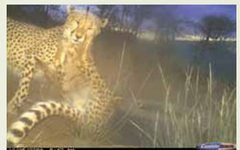
Cheetahs caught in motion camera in Ghanzi.