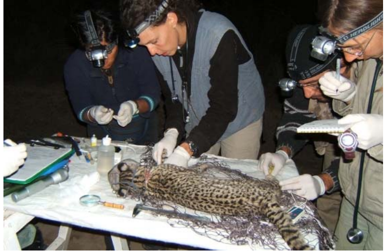
WCS-Field Veterinary Program personnel during Geoffroy's cat manipulation (Proyecto Gatos del Monte).

Spatial ecology, demography, and diet. Home ranges for males during 2002 were near 202 ha and that of the single female was 27 ha. The second year of the study (2003) coincided with a severe drought and a strong decline in prey abundance. As a result, four females occupied an average home range of 255 ha, and the home-range size of the single pre-drought female increased by a factor of two. Geoffroy's cats predominantly used habitats of dense cover during the pre-drought period, but they became more habitat generalists during the drought. The occurrence of this drought event led us to study for the first time the spatial ecology of a small wild cat species under nutritional stress in South America. Details on this results have been published in the Journal of Mammalogy 87(6):1132-1139.