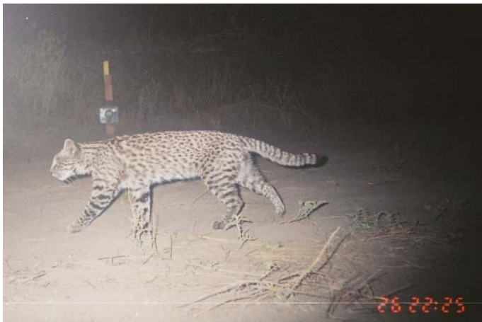
Male Geoffroy's cat camera-trapped in Lihue Calel National Park (Proyecto Gatos del Monte).

A new stage of this research on the spatial ecology of Geoffroy's cat was started in may 2007. After 3 month of captures (1,102 trap nights), 15 individuals have been radiocollared. The radio-telemetry data obtained to date has not been analysed yet.