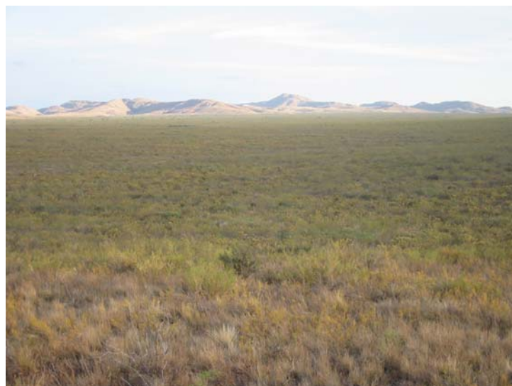
Desert scrub, a typical Geoffroy's cat habitat in the Monte eco-region of Argentina (Proyecto Gatos del Monte).

Diet of Geoffroy's cat and other mesopredators (Pampas fox, hog-nosed skunk) is being described following analysis of scats collected opportunistically in LCNP and surrounding cattle ranches. Further, seasonal density of main carnivores' prey (small rodents, birds, and hares) is being assessed to study prey selection by these predators.