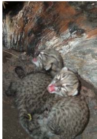
Two Geoffroy's cat cubs, here 10 days old, born in January 2006.

Several litters (1.8 cubs per litter) were recorded during summer and spring, but no reproductive activity was observed during the drought of 2003. Main mortality causes detected were starvation and high parasite loads (during the drought of 2003), road accidents, predation by puma, and illegal hunting (outside the national park).