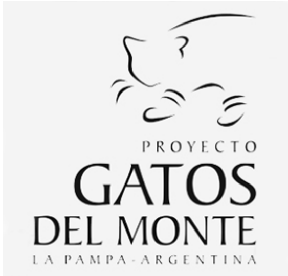
Proyecto Gatos del Monte

Geoffroy's cat is a little known South American felid recently upgraded to the "near threatened" category due to human-related impacts upon its populations. This multi-disciplinary project is collecting critical data necessary to develop a conservation strategy for Geoffroy's cat and to evaluate population viability and conservation needs of this species outside protected areas in Argentina.