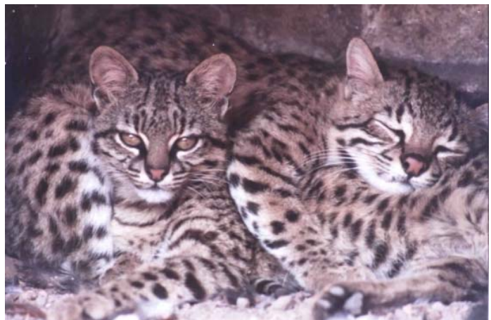
Geoffroy's cats