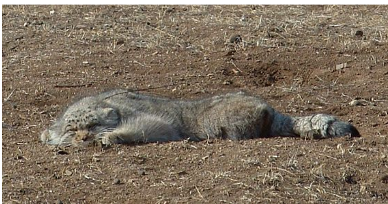
Male Pallas cat in winter. Pallas cats are not fast runners and the grassland steppe provides few places to hide. When in the open, Pallas cats often crouch down and remain motionless to avoid detection. Even a short covering of grass allows them to remain concealed. However in the dead of winter, with no cover, this strategy can backfire!