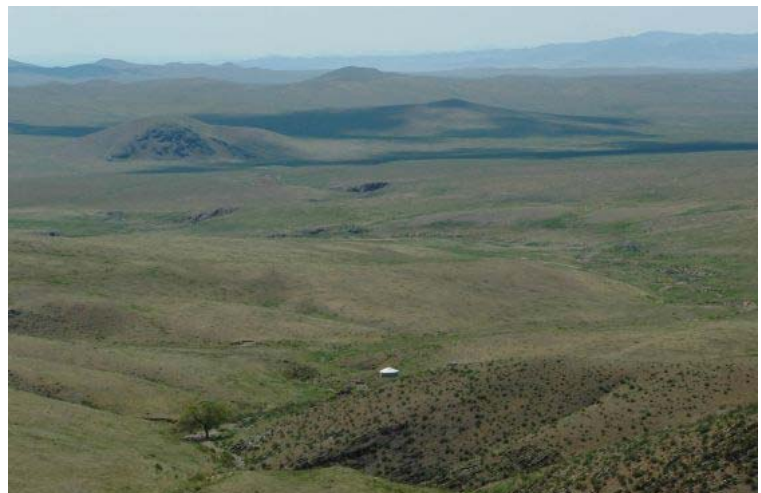
Showing typical steppe, ravine and valley habitats during summer with a traditional Mongolian ger site in centre.

To model data on resource and space use and critical habitat to improve our understanding of how the species ecology influences its vulnerability under present and future hypothetical conditions.