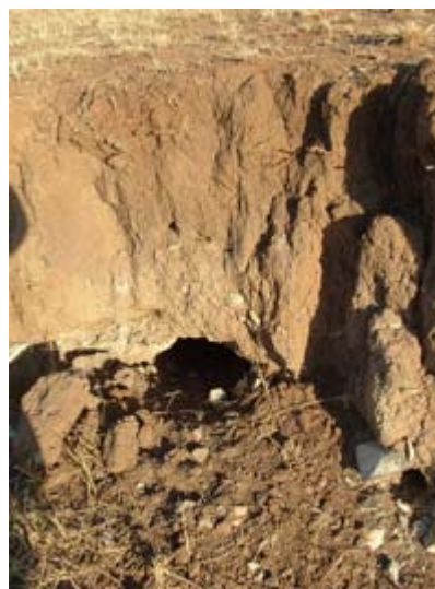
A Pallas cat sheltering hole, dug and previously inhabited by marmots

Data on sheltering behaviour and characteristics have been collected from five cats. Sheltering sites have either been burrows made by marmots ( Marmota sibirica ) or fissures or holes in rocks or cliffs. The shelters are likely to function as protection from extreme cold and predation. The data show a shifting den system; shelters have been repeatedly used when the cat is using the surrounding part of its home range. This was also true of a female who was raising a litter; she changed dens twice, moving her litter a distance of 5 km each time. In summer 50% ( n = 9 ) of shelters were under rocks and in winter 85% ( n = 19 ) of shelters were in marmot burrows and all were south facing. The sample indicates the importance of marmots in providing Pallas cats with suitable sheltering habitat. Marmots are intensely hunted in many parts of Central Asia for food and skins, their decline may affect the behaviour and potentially survival of many other species.