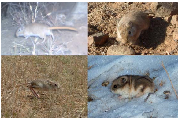
Some of the small mammal prey present in the study area, from top left clockwise, jirds ( Meriones unguiculatus ), mountain voles ( Alticola royalii ), Siberian jerboa ( Allactaga sibirica ) and Russian dwarf hamster ( Phodopus sungorus ). Daurian pika ( Ochotona daurica ), ground squirrels ( Spermophilus dauricus ) and Brandt's voles ( Microtus brandtii ) are also preyed upon by Pallas cats in our area.

Spotlight surveys are used to measure the density of sympatric carnivores and nocturnal prey species (jerboa and tolai hares) using Distance methodology (Buckland, et al. 2001). Eight 7 km track transects are conducted each weekly session. Lines have been selected to cover all the habitats in roughly the proportion they are available giving seasonal densities and the relative importance of different habitats to the surveyed species. Local nomadic peoples are also an important ecological variable as they are ubiquitous throughout the Central Asian steppe ecosystem and within the majority of Pallas cats range. The movements, hunting practises and herd sizes of nomadic herdsman inhabiting the study area are being mapped to find if any spatial relationships between people and the cats exist. All the data is compiled within a GIS. In addition, the diet of Pallas cats is being determined by scat analyses, to allow us to relate habitat selection to prey acquisition. The characteristics and preferences of Pallas cat den and sheltering sites are also being investigated as a potential critical resource. With the above sampling strategy we hope to gain some solid data describing Pallas cats' ecological strategy and how this relates to present and future threats within its habitat.