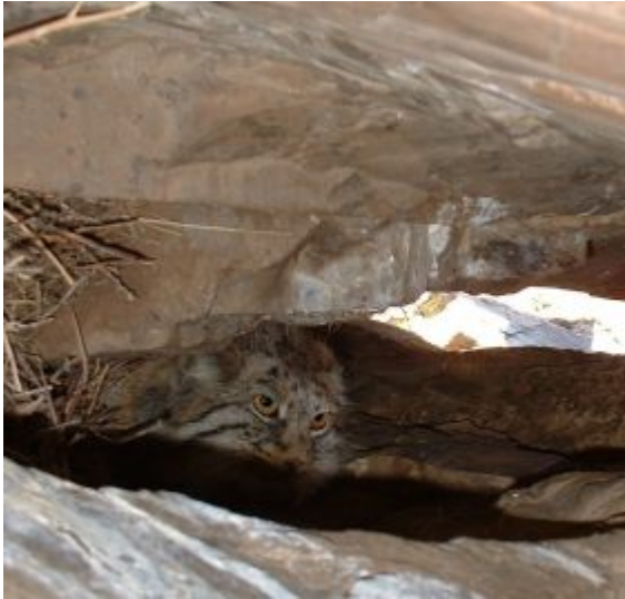
Pallas cat hiding under a rock

The steppes of Mongolia are one of the few places in the world containing healthy populations of Pallas cat. This project is a joint venture between Mongolian and foreign researchers set up to address our poor understanding of the ecology and conservation issues of Pallas cat by intensive field based research.