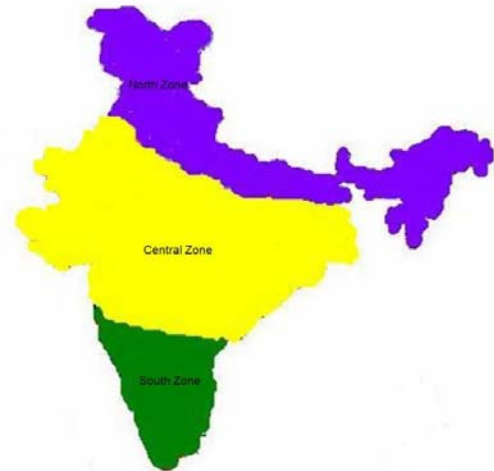
Map of India showing the North, Central and South Zones for the project.

We divided the country into three broad zones viz. The Northern zone (including the Himalayas and foothills), the Central zone comprising of the desert, the Deccan plateau and eastern India and the Southern zone (south of the Deccan plateau; see map). We sample from each of these zones, along with GPS records of latitudinal and longitudinal co-ordinates for each sample.