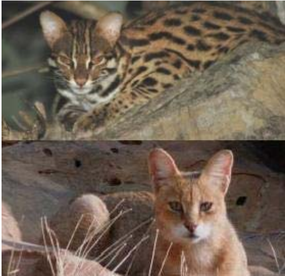
The study species: Leopard cat (top,), Jungle cat (bottom,).

The family Felidae is well represented in India, with 15 species occurring here, making it the richest in cats worldwide. However, except for the large cats the rest figure very poorly in research and conservation policies in the country, probably because of their rarity and elusive nocturnal habits, coupled with cumbersome bureaucratic formalities in studying rare species. Fortunately, in the past few years non-invasive molecular techniques have been introduced in wildlife research in India, which has made small cat research easier.