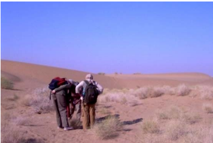
Collecting scats in the desert in Jaisalmer, (Rajasthan, Western India), part of the Central Zone in the project. Being strongly associated with water, the introduction of irrigated agriculture in the desert may have helped the jungle cat spread into this region.

Once the samples are brought to the laboratory, we extract DNA using commercially available Qiagen extraction kits. The extracted DNA is then amplified with primers specific to the jungle cat and leopard cat. This eliminates all other species and we use the positively identified samples for further amplifications and sequencing with other primers, targeting various portions of the mitochondrial DNA.