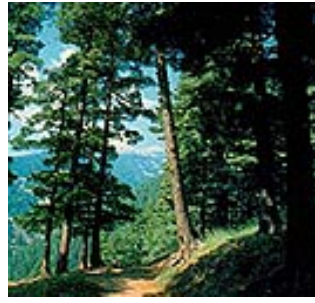
Pelister River and a molika forrest on Pelister

The best way to reach Pelister would be from Bitola, across the villages of Trnovo and Magarevo. Pelister is situated 14 km. from Bitola, 75 km. from Ohrid's Airport or 170 km. from Skopje's Airport. You can be sleep over in many hotels, or in 3 mountain houses.