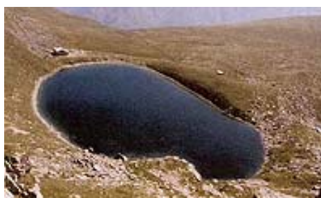
The two glacial lakes called Pelister's Eyes