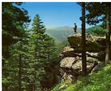
Pelister in the spring