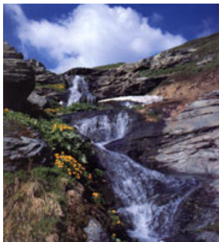
Crveni Steni (Red Rocks) on Baba Mountain

West of Bitola , near the town, is the Baba (meaning Grandma) Mountain with the magnificent Mount Pelister (2601 meters, or 8533 feet). Pelister is the third highest peak in the Republic of Macedonia after Korab and Titov Vrv. Other peaks besides Pelister are Dva Groba (2514 meters), Veternica (2420 meters), Muza (2350 meters), Rzana (2334 meters), Shiroka (2218 meters), Kozji Kamen (2199 meters), Griva (2198 meters), Golema Chuka (2188 meters), Skrkovo (2140 meters), Babin Zab (1850 meters), and many more. The Baba massif splits up the rivers in the region, so that they either flow towards the Adriatic, or the Aegean sea.