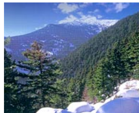
Pelister in winter

Pelister is also known for its two mountain lakes, which are called Pelister's Eyes. The Big lake is 2,218 meters above the sea level while the Small lake is 2,180 meters high. Here are the sources of many rivers. The climate in the Pelister National Park is diverse.