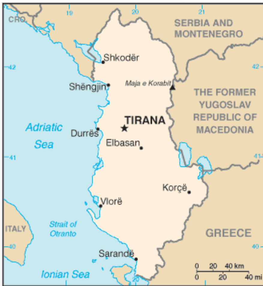
Map of Albania

Albania consists of mostly hilly and mountainous terrain, the highest mountain, Korab in the district of Dibra reaching up to 2,753 m. The country mostly has a land climate , with cold winters and hot summers .