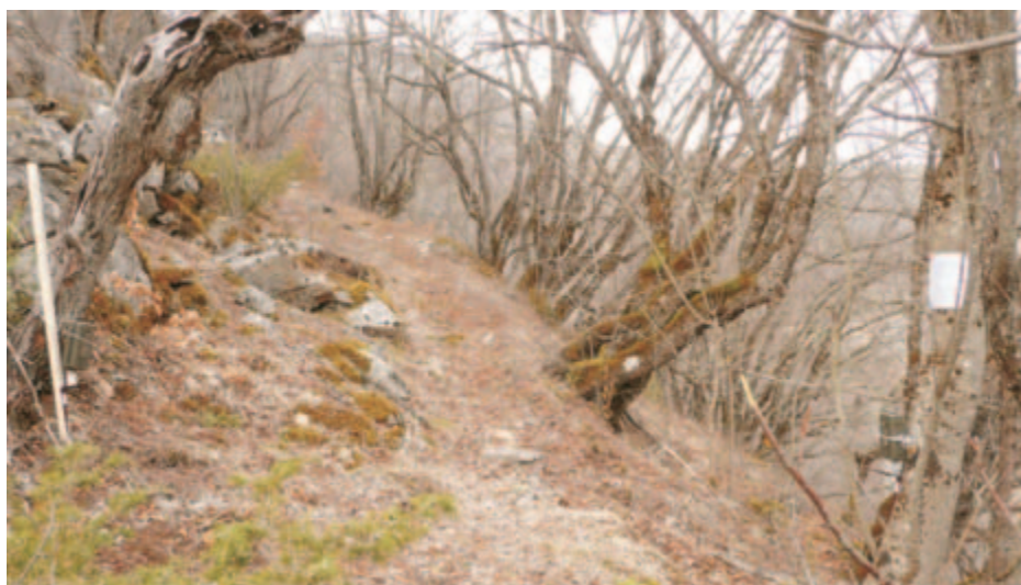
Fig. 3. Camera-traps set at a hiking trail in the vicinity of Radika River (Mavrovo NP)

The camera-trapping method is a widely used method for the estimation of the number of individuals in the study area within a confidence interval by means of capture-recapture analysis. It is very often used on species with an individually different coat pattern, such as the spotted cats. Moreover, using the camera-trapping method, one gets an idea of the presence of other species (prey and predator species) and obtains basic information about dispersal and spatial use as well as indications for the survival of individuals and reproduction. If conducted over several years capture-recapture estimation gives an excellent indication of the population development.