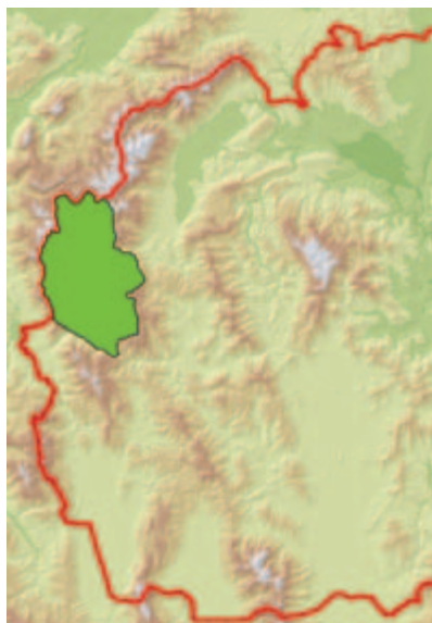
Fig. 1. Location of the Mavrovo National Park Macedonia

The Mavrovo National Park (Fig. 1) with a total surface of 730 km 2 , is the largest of the three national parks in Macedonia. It was established in 1949 when forested areas around Mavrovsko Pole were proclaimed as National Park. Furthermore, in 1952, the borders of the park were enlarged significantly and gained the today's shape and size. The area of the park belongs to the Shara Mountain group of mountains and is part of the Scardo-Pindic system (SINADINOVSKI, 1993). Most of the southern part of the Shara Mt., the whole missives of Korab and Deshat Mts. and a considerable part of Bistra Mt. are constituent of the Mavrovo National Park. The relief is very interesting and diverse. It is mainly consisting of steep mountain slopes, gorges, high mountain pastures and valleys. The National Park comprises 36 villages in four local regions. Alpine mountain vegetation is represented only on Korab Mt., while on the mountains Bistra, Deshat and parts of Shara Mountain there is sub-alpine vegetation.