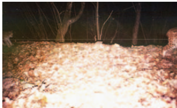
Fig. 5. Lynx mother with cub on 25.03.2008 at vicinity of village Janche