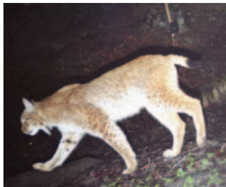
Fig. 4. Lynx photo on 08.04.2008 at vicinity of village Bibaj

of the Balkan lynx were taken which is strong evidence that this critically endangered lynx subspecies still exists. In addition, the data may allow making a quantitative estimation of the lynx population in the national park using photographic capture-recapture analysis.