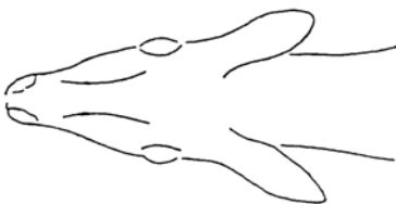
Fig. B: Head and throat