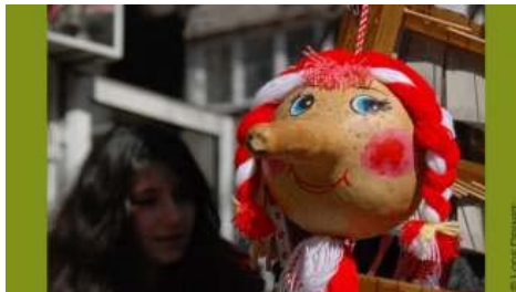
RED&WHITE SOFIA. On the 1st of March Bulgarians say goodbye to the winter. They buy each other red&white threads to carry around until they see a stork and spring can begin.