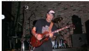
Ethno-Jazz: Vlatko Stefanovski

The two modern forms of Balkan folk music - pop folk and ethno-jazz - differ as a hand-rolled cigarette and an expensive cigar.