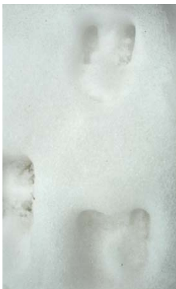
Chamois Rupicapra r. tracks.