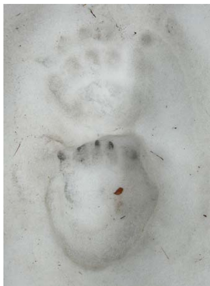
Bear Ursus arctos tracks.