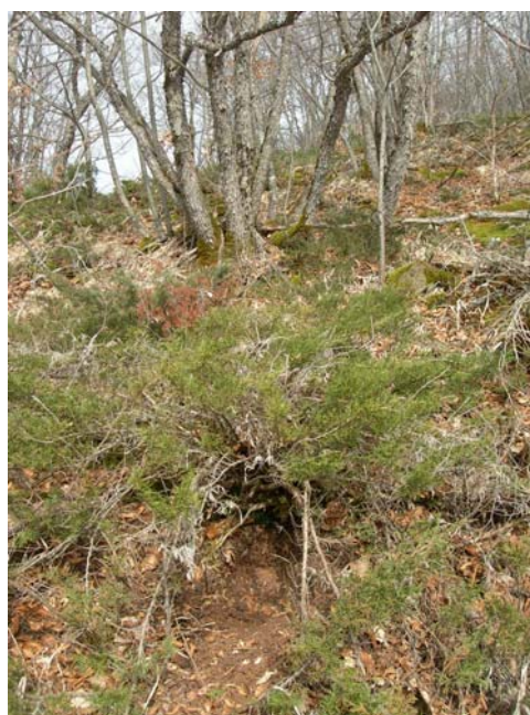
A hare Lepus europaeus hide.