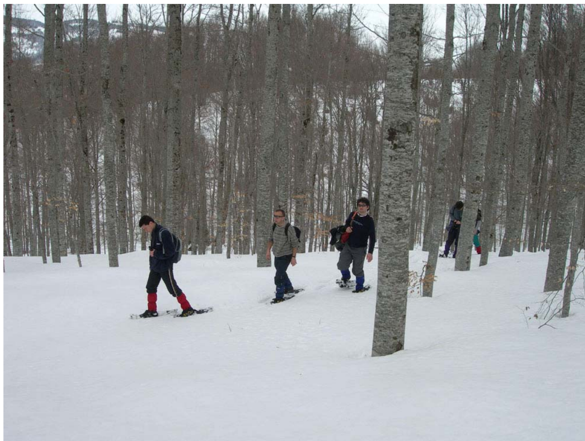
The group snow-tracking through the beech forest at the southern shore of Mavrovo lake.