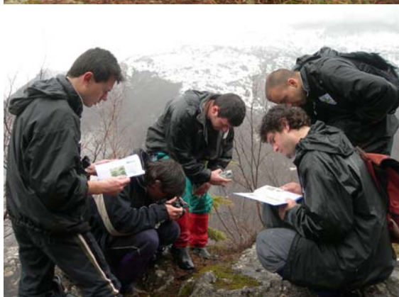
The group identifies scats (of a roe deer) with the help of the Field Handbook.