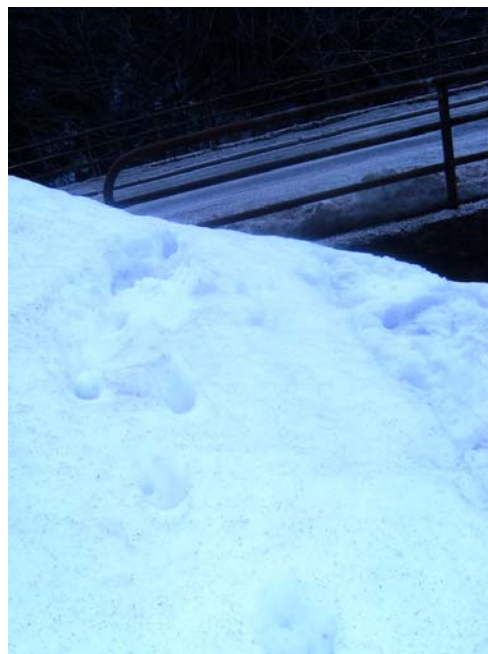
Backtracking of the lynx tracks ended in the valley bottom.