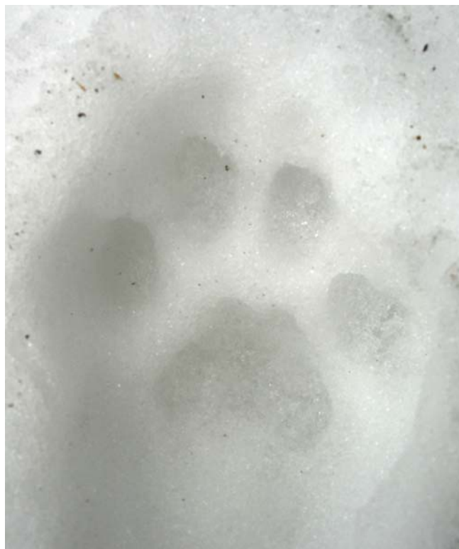
Finally, tracks of lynx Lynx lynx were encountered.