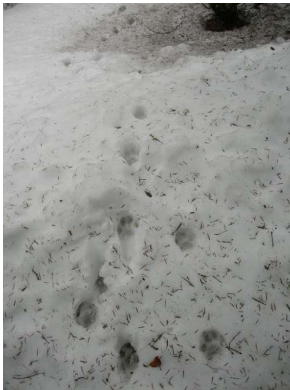
They were actually even two lynx individuals, separating for some meters from time to time.