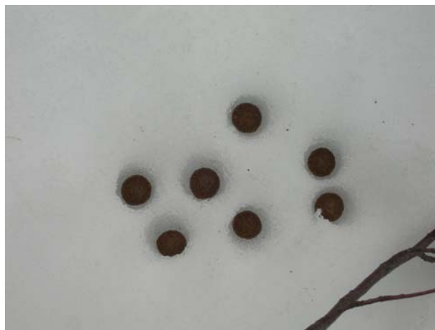
Hare scats art.