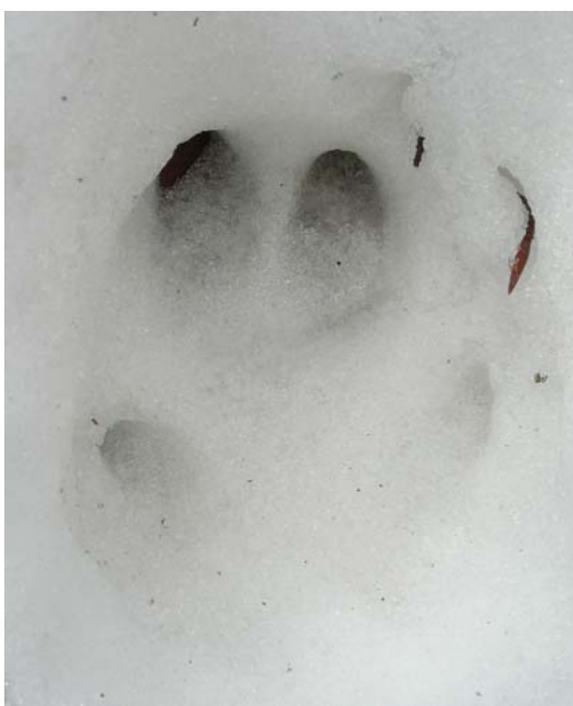
Footprint of a wild boar Sus scrofa .