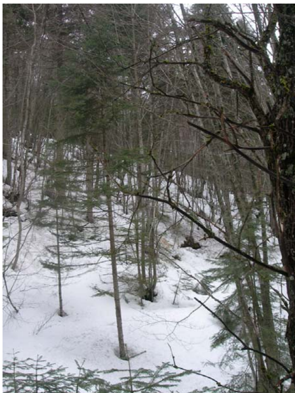
Mixed fir and beech forests form the habitat in this area.