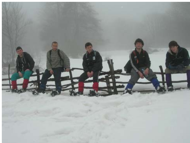
Break after quite an unsuccessful tracking day.