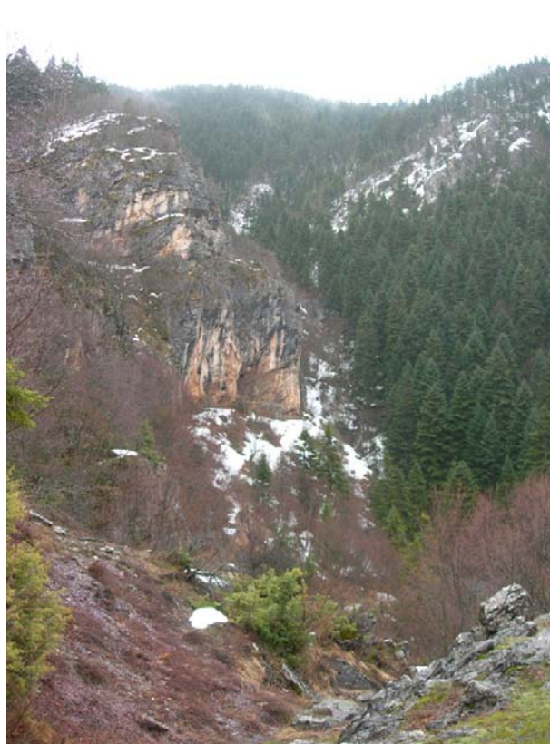
Mixed forests and partly rocky areas with caves stretch above the village Sence.