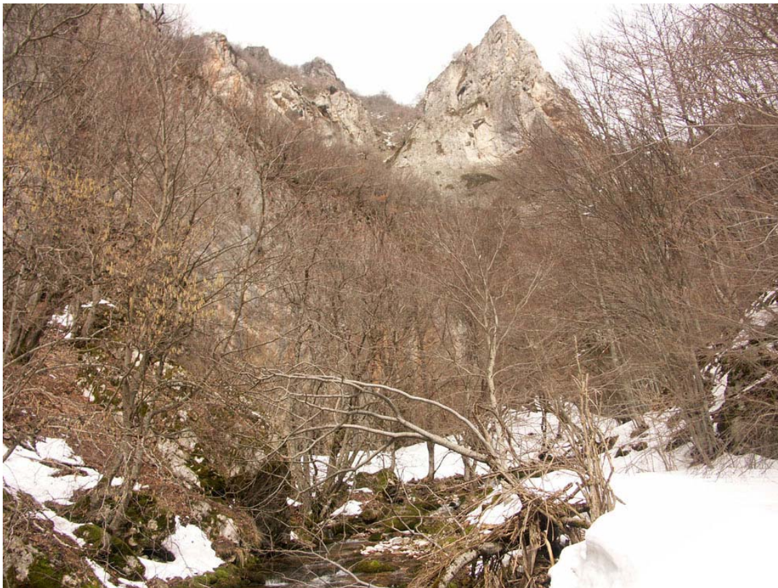
Beech and oak were the predominating tree species during the transect from Tresonče to the Alilica cave.

Tuesday, March 21, 2006 – Tresonče, Alilica cave