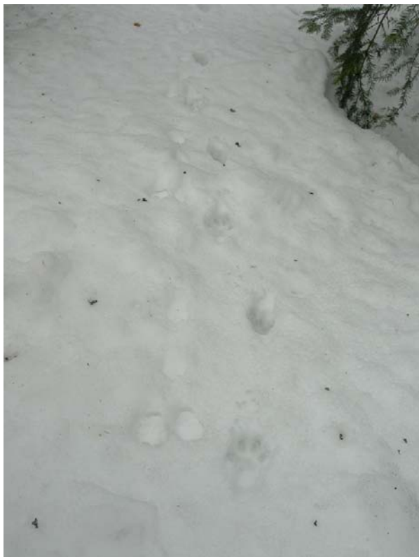
The trails of a lynx and a hare are crossing each other.