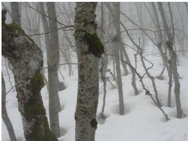
Beech forest with still a lot of snow.