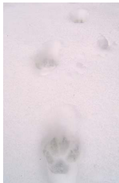
Big canid, probably Canis lupus .