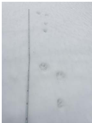
Only hare (Fig.), fox and badger tracks were found.